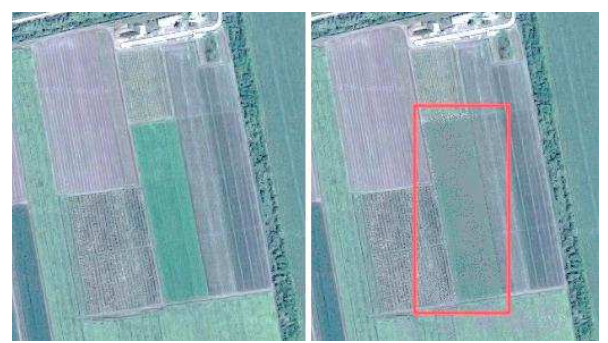
Figure 1 – Satellite images of the same field are made at intervals of 10 days

In addition to identifying phenological changes, one can consider methods that allow meteorological and agrometeorological changes to be identified. Their content does not change in general. It is necessary to allocate time series of data (meteorological and agrometeorological indicators) which characterize the research area, make its decomposition, allocate seasonal and trend components, and also estimate the residual component. After this procedure, it is possible to calculate the forecast as a seasonal component with a certain confidence interval \hat{S}_t , and directly to the time series of data \hat{Y}_t . The forecast data are valuable information for the planning and organization of agricultural work, in particular, in the monitoring of crop yields. In Figure 1 Two pictures of the same field are displayed at intervals of 10 days. Changes in the image are visualized without the use of software, only by viewing the image. However, for effective crop management, such undesirable changes need to be identified before they are visible to the visually in order to take the necessary action and not to lose the crop.