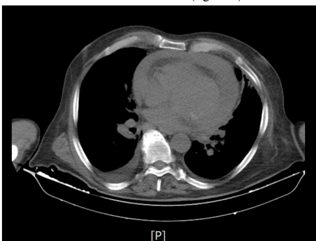
Fig. 2. The second non-contrast CT scan of the patient.

Having seen that the patient had no urine output during follow-up, contrast nephropathy was accepted due to his history of 5 days earlier. With the patient having chest pain, physical examination revealed bibasilar crackles in respiratory sounds. Moreover, heart sounds were heard deeply during cardiac auscultation. In the emergency department, a non-contrast thoracic computed tomography scan was performed to the patient who had an increased cardiothoracic index as it was seen by portable chest X-ray. 2 cm of pericardial effusion was detected in his CT scan (figure 2).