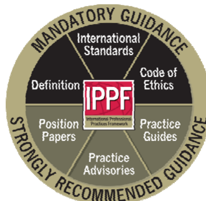
Fig. 2. Mandatory Guidance