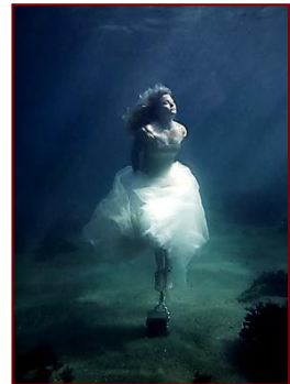
Ill.6. Picture by M. Mawson “Under Water”