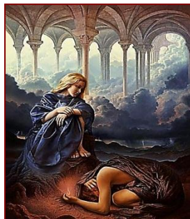
Ill.7. Smorenburg “The Gift”

I: Thank you for your work. I feel relief and strength to release from the burden of problems. Let’s view the personal Tattoo drawing tomorrow, I am in a hurry.