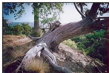
Ill. 3. Laspi Bay

P.: Really. Although it’s just the root of the tree. Obviously, your dependence on your father is manifested. As a result, shame can be catalyzed