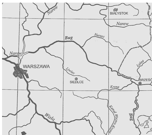
Figure 1. Localization of the investigated area

According to the physico-geographical division (Kondracki 2002) the investigated objects are situated in the mesoregion of the Podlasie Bug river gap. That region is a middle segment of the Bug river valley and belongs to the South Podlasie Lowland (Fig.1).