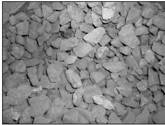
Fig. 1. Recycled concrete aggregate

Steelmaking slag (Fig.2.) used in our study was obtained from steel production in U.S. Steel Kosice, Slovakia. Two different fractions, 4/8 and 8/16 mm were used as natural aggregate replacement in concrete mixtures.