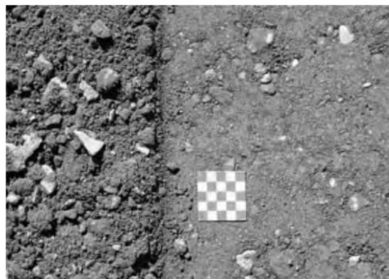
Fig. 2. Steelmaking slag

Steelmaking slag (Fig.2.) used in our study was obtained from steel production in U.S. Steel Kosice, Slovakia. Two different fractions, 4/8 and 8/16 mm were used as natural aggregate replacement in concrete mixtures.