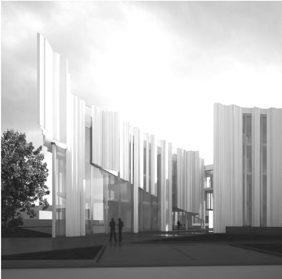
Fig. 2. The view of main entrance

This division is the common denominator of the entire functional program of stories, even though each of them has a specific purpose relevant to software solutions.