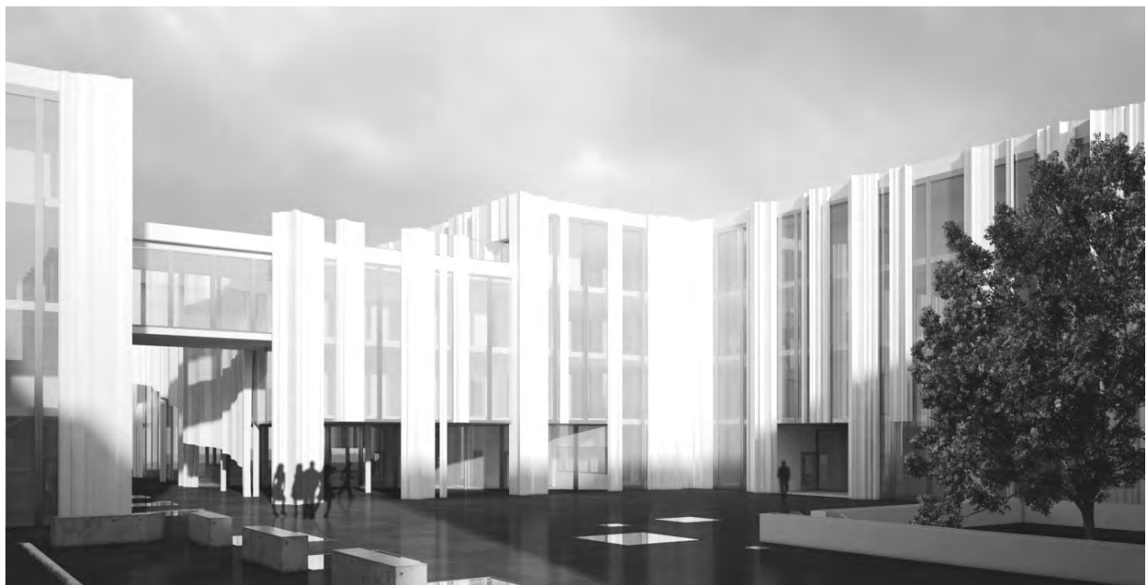
Fig. 3. The main courtyard – view

Architectural design is not only an addition to the urban fabric. It is a response to the trend of the times which is the need to constantly improve skills. Continuous education of young people will give a direct impact on the development of urban agglomeration. This translates into a constant improvement of the national culture and art; meet the aspirations of the intellectual and personal gifted individuals. The natural development of society and the well understood programming factors create a situation of constant pressure on the need for young people to create educational opportunities at a higher level. This occurs throughout the world. Today's pace of training of staff with higher education is related to the natural rate of generation of income in the country. In the latter should precede the other. Contributing to education should be considered as investment works. National income creates education and its development, and the direction and size of expenditures associated with the parts business in the industry and the development of art and culture. Previous actions leading countries prove to us that it is worth investing in "human intelligence" because the future expenditures are repaid in two ways.