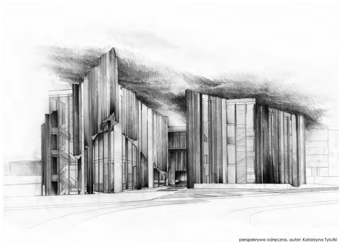
Fig. 4. Solid object. Freehand perspective. Author K. Tylutki