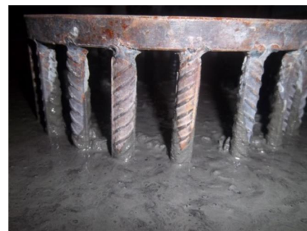
Fig. 3. Breaking capacity of self-compacting fiber reinforced concrete mixture

Self-compacting concretes are used for concreting highly reinforced constructions, so the filler capacity of prepared self-compacting fiber reinforced concrete mixtures was determined in the work in terms of fluidity and visual J-ring method. Determination of the capacity for self-compacting according to J-ring method showed excellent ability of self-compacting fiber reinforced concrete mixtures obstacles to overcome closely set reinforcing rods without blocking (Fig. 3). It has been found that the obtained self-compacting concrete mixtures reinforced with basalt fiber, are characterized by high density (average density of concrete mixture is 2400-2425 kg/m 3 ) and low air consumption (0.35%).