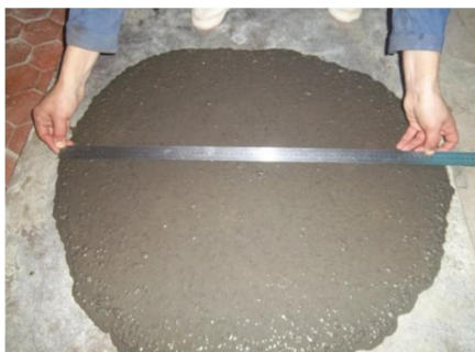
Fig. 2. Plasticity of self-compacting fiber reinforced concrete mixture

The carried out research of influence of fiber on the properties of self-compacting concrete found that introduction fibers in its composition does not cause are duction in plasticity of concrete mixture (Fig. 2). Thus, cone flow of self-compacting concrete mixture was 780 mm with conditional viscosity t_{500}=6s with water-cement ( B/I=0,3 ), with the introduction of basalt fibers cone flow is 790 mm, and viscosity t_{500}=5 s .