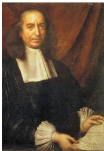
Fig. 6 - Marcello Malpighi

He is regarded as the founder of microscopic anatomy and may be regarded as the first histologist [17-20]. In 1661 he identified the pulmonary capillary network, proving William Harvey's theory on blood circulation. He discovered the taste buds and was the first to see red blood cells and realize that they gave blood its color. Malpighi first demonstrated the lymphatic follicles in the spleen and described the renal glomerular capillaries, both of which bear his name. He demonstrated that bile is secreted by the liver, not the gall bladder. The great Swedish botanist, Linnaeus named a genus of plants after Malpighi, the Malpigiaceae.