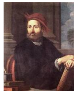
Fig. 5 - Andrea Cesalpino

One of the founders of botany Andrea Cesalpino (1525-1603) (Fig. 5), also known as Caesalpinus, studied under Realdo Colombo and Luca Ghini in Pisa, where he received his degree in 1551. Later in 1555 he succeeded Ghini as director of the Botanical Garden of Pisa and as lecturer of medicine. Cesalpino was Chair of Medicine from 1569 to 1592, when he moved to Rome where he served as physician to Pope Clement VIII and taught medicine at the Sapienza University [15].