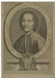
Fig. 7 - Giovanni Maria Lancisi

Well-known scientist and physician Giovanni Maria Lancisi (1654-1720) (Fig. 7) graduated from Sapienza University (Rome). In 1684 he was appointed Chair of anatomy at this university, a position he held for 13 years [11]. At the age of 34, Lancisi was selected by Pope Innocent XI to be his personal physician. When the Pope died in 1689, Lancisi returned to private practice and teaching. A decade later, Lancisi was again called to serve the Vatican. This time he was consulted in the case of Innocent XII for whom he cared until the Pope's death. His successor, Clement XI, also appointed Lancisi to the prestigious position of Physician to the Pontiff [21-23].