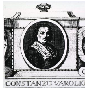
Fig. 4 - Constanzo Varolio

method he was able to observe several structures, including the hippocampus, the cerebral peduncles, and the pons [7, 12, 13]. Varolio rediscovered "Musculi erectores penis" (i.e. mm. bulbospongiosi and ischiocavernosi) and gave a correct description of the mechanisms of erection [14].