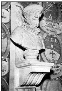
Fig. 3 - Giulio Cesare Aranzi

Giulio Cesare Aranzi (Fig. 3) graduated from Bologna in 1556. The same year, Aranzi became professor of surgery and anatomy at the University of Bologna. Aranzi began as a lecturer in surgery and in 1570 he was able to have 2 subjects, surgery and anatomy, separated, so that each would have its own professorship. He was the first lecturer at the University of Bologna to hold a separate professorship of anatomy. He held both positions for 33 years until his death in 1589 [9, 10].