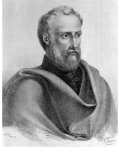
Fig. 2 - Giovanni Battista Canano

important contribution by Canano was the first public demonstration of venous valves performed in 1547 [5, 8].