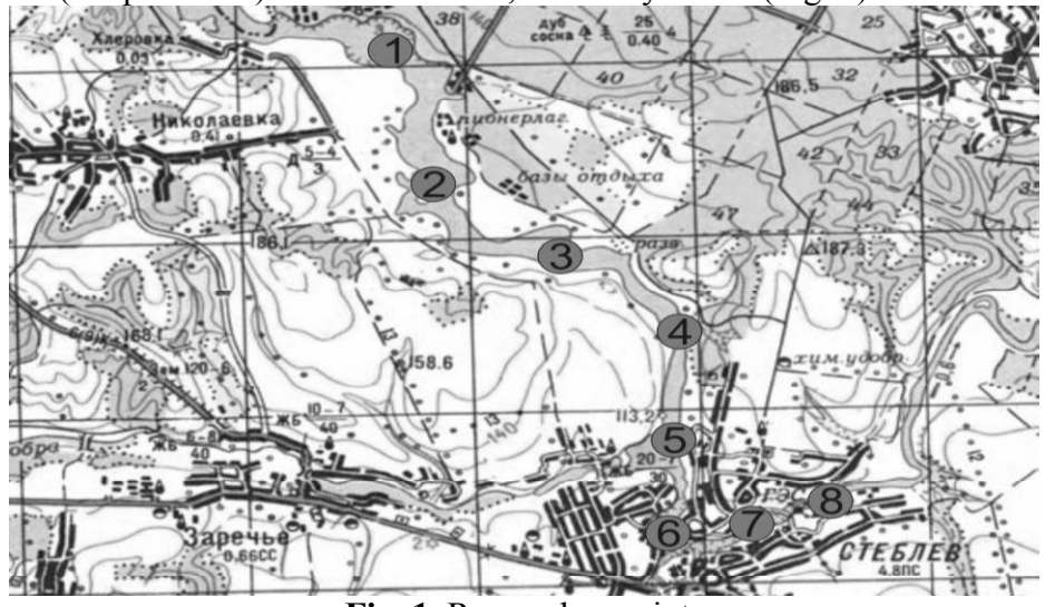
Fig. 1. Researches points

Research was held in September 2013 on eight points at Steblivske reservoir, located on the Ross river (Dnipro basin) near uts. Stebliv, Cherkasy oblast (Fig. 1).