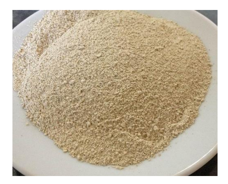
Fig. 3. Nanopowder made of Jerusalem artichoke by freeze-drying

Preparation of the samples. To study the influence of cryogenic treatment of raw material, low-temperature finely dispersed grinding and freeze drying, we performed preparation of the samples. They were ground into pieces with thickness of 0.5...1.0 cm and length of 4...5 cm, then put on trays for consequent freezing.