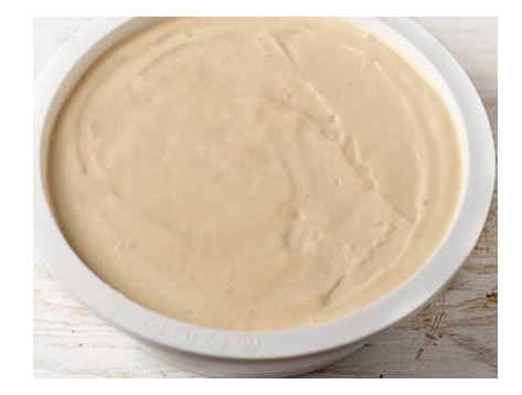
Fig. 2. Frozen finely-dispersed puree from Jerusalem artichoke

Fig. 1. Original raw material (Jerusalem artichoke tubers)