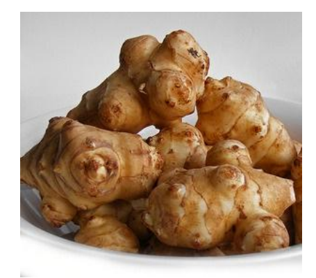
Fig. 1. Original raw material (Jerusalem artichoke tubers)

The study was conducted by using Jerusalem artichoke tubers (Fig. 1), frozen finely dispersed purees (Fig. 2) and the nanopowders made of them by freeze-drying (Fig. 3).