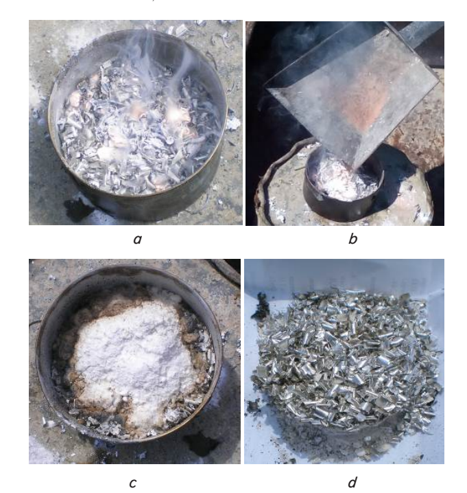
Fig. 4. Results of tests of extinguishing magnesium flame with a model sample of dry mixtures coating with the addition of minerals: a – magnesium ignition, b – extinguishing of flame, c – formation of combustible substance of the insulation layer on a surface, d – results of extinguishing

Table 2 gives results of mass loss and time of extinguishing of the model fire.