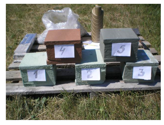
Fig. 1. Model samples of containers for the storage of weapons and ammunition that were treated with an organic coating with an addition of: 1 – aluminosilicate microspheres; 2 – perlite; 3 – basalt scales; 4 – metallurgical sludge; 5 – ashes

and astringent, which consisted of 16 % PVA dispersion and water. We stirred the given organic and neogenetic mass, added 10 % of fillers and applied to wooden samples, which were made from wood with a thickness of 19 mm, with an average size of 190 \times 155 mm and a height of 140 mm to create a wood coating. We treated fire protected model samples of wooden containers for the storage of weapons and ammunition with organic coatings with an addition of: aluminosilicate microspheres, perlite, basalt scales, metallurgical sludge and ashes (Fig. 1).