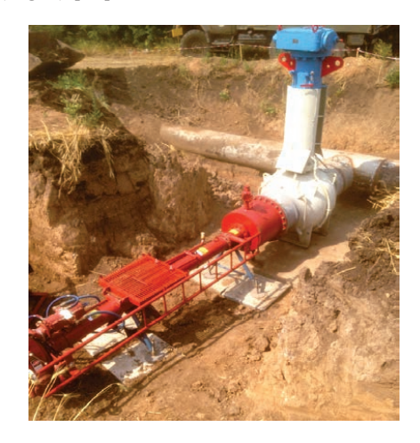
Fig. 3. TD Williamson hydraulically-operated tapping machine with the housing adapter mounted to the branch connection

The works on the connection of 2 branches of DN 700 to the gas gathering main in the area of the valve 8 and the valve 20a included the developed complex of works. The complex included preparation, hot tapping, using modern equipment of the TD Williamson company (Fig. 3) and finishing works (Fig. 4) [30].