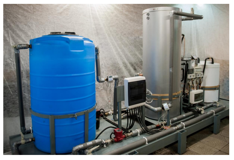
Fig. 1. Experimental stand of multifunction thermal point

cost of energy carriers, availability of connection of gas, the electric power, geographical arrangement of the building, geology, depth of occurrence of subsoil waters, orientation of the building concerning parts of the world, capital and operational expenditure is different. In one case the main gas, in another – bituminous coal, in the third the heat pump and so on will be an optimum system of heating. The option which reflects the most probable situation for the Midland of Russia is studied. One of the tasks of the multifunction thermal point is the creation of a system of heating, conditioning and hot water supply more favorable and energetically effective, than traditional systems. For continuation of further research, the maximum threshold capital expenditure and these values designate the lower bound of the economic feasibility of the developed installation.