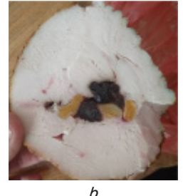
Fig. 3. Photographs of meat product with the addition of dried organic raw materials, obtained in plant for the low-temperature treatment of meat products by IR-radiation: a — whole meat product; b — meat product that is cut through the center