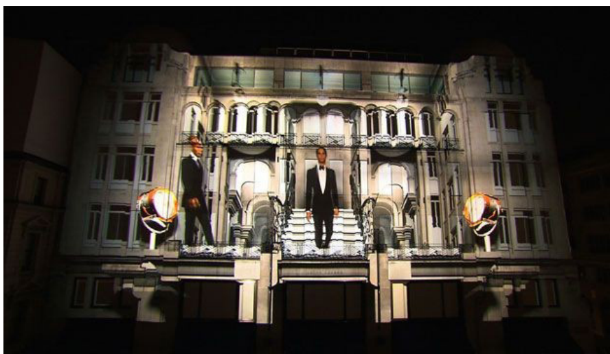
Figure 5. 3d image projection on The Official Ralph Lauren 4D Experience fashion show (USA, New York, 2010)

The next spectacular fashion show “The Official Ralph Lauren 4D Experience” (USA, New York, 2010) is striking in its originality (see Figure 5). It would seem that it was impossible to imagine the outfit without a vivid, direct work of fashion models, who solemnly and harmoniously passed through it on a spacious, illuminated podium. However, at this show, everything (the room, the scenery, the stage requisites, and even the models) is a projection onto the facade of the building – there is only an illusion of reality in everything.