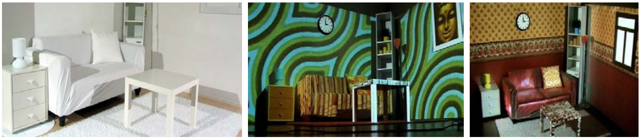
Figure 6. Living Room Projection by Mr. Beam

and texture of furniture, wallpaper and carpets in relation to real objects. Only two projectors are involved in the project. So, video mapping can completely replace the scenery and scenographic filling of the stage space (see Figure 6).