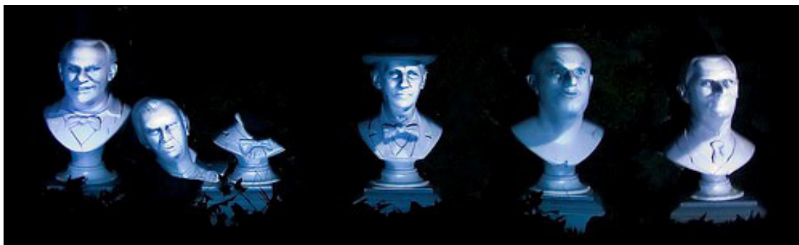
Figure 1. Projection of marble busts on the opening season of the Haunted Mansion in Disneyland (1969)

The first attempt at projecting onto non-flat surfaces took place in 1969 during the opening season of the Haunted Mansion in Disneyland. The marble busts of the characters of that spectacular performance, which, with the help of images of people projected on them, “came to life” and began to sing “Grim Grinning Ghosts”, became the surfaces for projection. This optical illusion of “singing” marble busts testified to the appearance of a new visual direction of the “spatial expansion of reality” (see Figure 1).