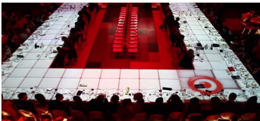
Figure 4. 3d-image projection on the show “The 2013 Toronto Fashion Incubator Fashion Show”

A striking example is the use of video mapping technology at a fashion show (“The 2013 Toronto Fashion Incubator Fashion Show”), where an image of a served dinner table was projected onto the entire podium plane with the use of eight projectors (see Figure 4). The implementation of this idea with the help of decorations and other attributes (live podium serving) would be extremely inconvenient and even dangerous, because models walk around the podium, and there is the audience around.