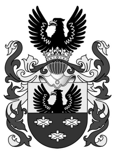
Fig. 8. Emblem Sulima