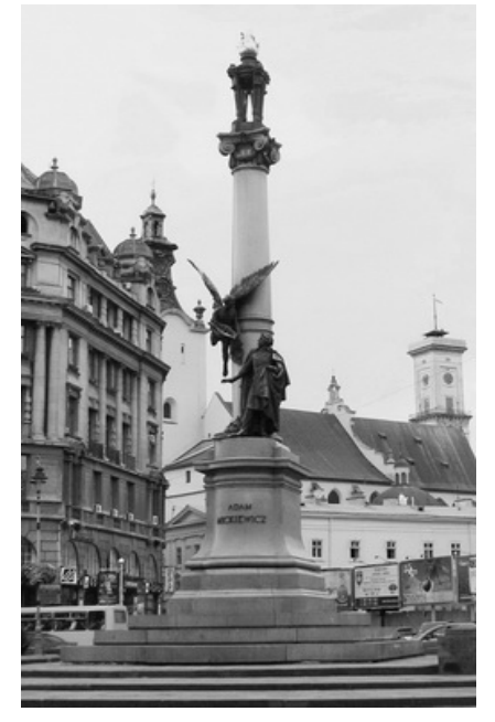
Fig. 10. The monument to Adam Mitskevych

The monument to the Polish poet Kornel Ujejski in front of the main entrance to the former city casino was unveiled in 1901. Antoni Popiel was also the author of the monument to the writer Joseph Korzeniowski in Brody (Lviv Region).