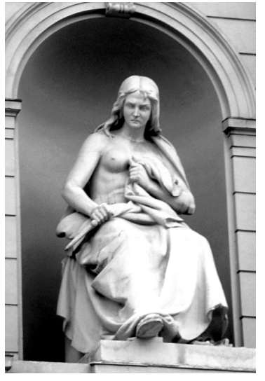
Fig. 9. Allegoric figure of Tragedy

He created "Joys and Miseries of Life", an allegoric ten-figured composition on the 4.2 \times 20 m size fronton with figures being almost three meters high, and allegoric figure representing Tragedy (fig. 9) in the right niche of the main facade of the theatre.