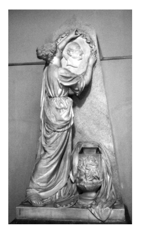
Fig. 2. Sculpture to Artur Grottger in the Dominican Church

He created numerous gypsum, terra-cotta, marble sculptures, as well as busts and medallions throughout his life. Among his notable works one can mention the sculpture to Artur Grottger in the Dominican Church in Lviv (1876–1880) (fig. 2) [9].