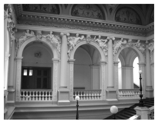
Fig. 6. Staircase of the Lviv Polytechnic main building

In 1874–1877 allegoric sculptures of Engineering, Architecture and Mechanics were created on the attic, and the staircase (fig. 6), the auditorium and the library of the Lviv Polytechnic University were decorated [14].