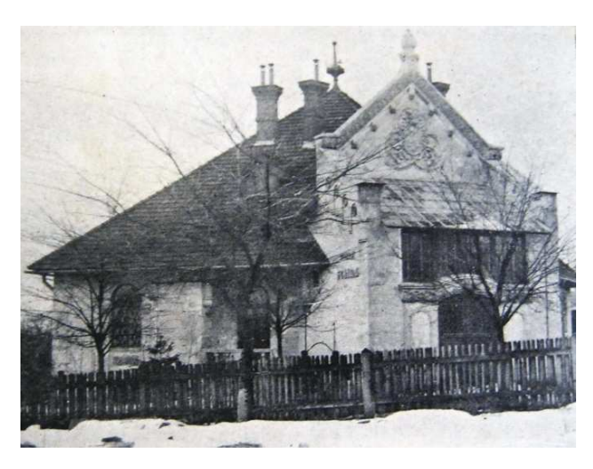
Fig. 7. "Sulima" villa

Among landmark Lviv buildings of the early 20th century, the construction and decoration of which involved many artists, became the Great City Theatre (1895–1900).