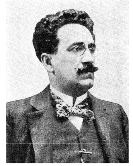
Fig. 1. Antoni Popiel

Antoni Popiel (fig. 1) was born on June 13, 1865 in the city of Shchakova, near the border of Silesia and Western Galicia [3]. He spent his childhood in the city of Brody [8].