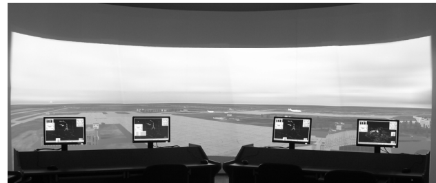
Fig. 2. 3D view of manoeuvring area of aerodrome

The Simulator complex “Control” includes the 3D view of an manoeuvring area of aerodrome (Fig. 2), which is used by the modules of the Integrated SMS in ATS for the initial, visual survey of hazards and risks on aerodrome and in the vicinity of aerodrome.