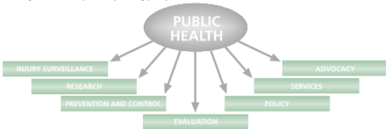
Figure 1 Transportation traffic injury as a public health problem [17]

In global environmental policy deliberations, transportation safety was also recognized at the recent Rio+20 UN Conference on Sustainable Development. There a clear link was made between transportation safety and sustainable development. Encouraging sustainable transport policy must include making non-motorized forms of transport accessible and safe: 27% of global road traffic deaths are among pedestrians and cyclists (alsomay considered as third party to motorized transportation. To date, these road users have been neglected in transport and planning policy.