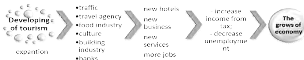
Fig. 3. Socio-economic impacts of developing tourism infrastructure