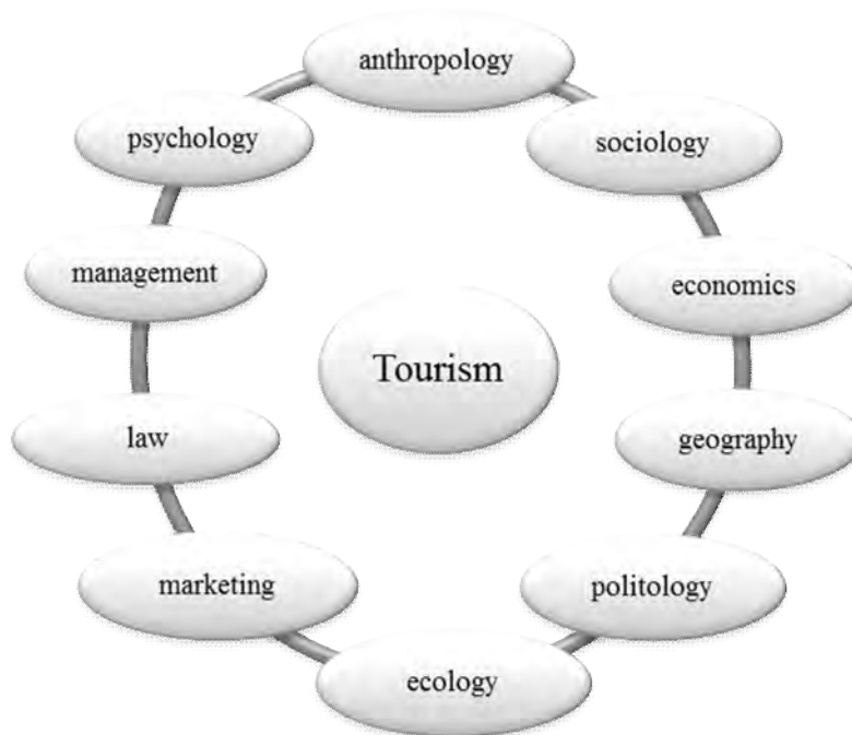
Fig. 2. The relationship of tourism with other disciplines

the relationship with other disciplines. Fig. 2 shows areas that centered on tourism and have connection with it.