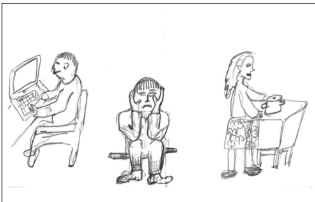
Figure 2. “Solitude” drawn by patient M., 15 years old, diagnosed with VD and hypotension, before treatment

Teens stated that the music helped them “get to know themselves”, ie to assess their strengths and weaknesses