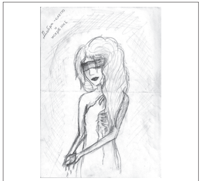
Figure 3. “Kindness is blind and sincere” patient M., 15 years old, with VD and hypotension after treatment