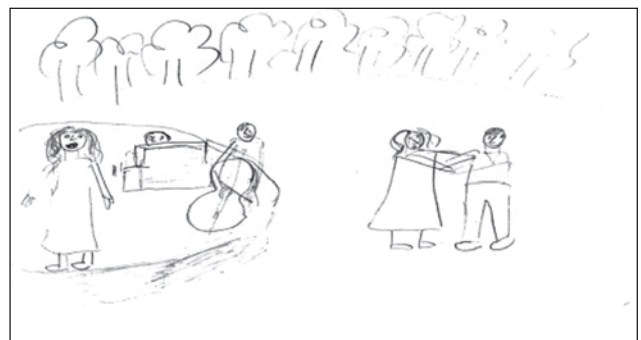
Figure 5. “A world where all are singing and dancing” patient D., 13 years old, with VD and hypotension after treatment