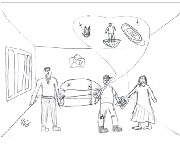
Figure 4. “Life under pressure” patient D., 13 years old, with VD and hypotension before treatment