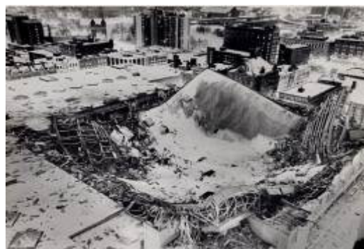
Figure 7 – The fall of a sports arena in the city of Hartford (USA), 1978