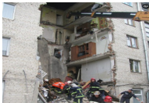
Figure 6 – Building collapse, Lutsk, Ukraine, 2012

due to design failures, such as in January 1978 in the city of Hartford, Connecticut, USA, due to overloading with snow in the city center, where a hockey match was conducted during the day, overnight collapsed on the night from a height of 30 m a sports arena measuring 92 by 110 m (Fig. 7). The investigation revealed errors in the calculations of designers [23].