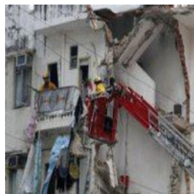
Figure 1 – Building collapse in Hong Kong, 2010

As a result of the study, a table was created showing examples of accidents and structures in recent years with available information on their destruction, the location and incident causes, as well as the number of victims.