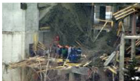
Figure 2 – Building collapse in Surgut, 2014

In November 2012, in Alexandria, Egypt, 10 people were killed when the high-rise building under construction collapsed. Late in the evening, the eleven-story building collapsed into neighboring buildings. All the dead and wounded - the inhabitants of these houses [13].