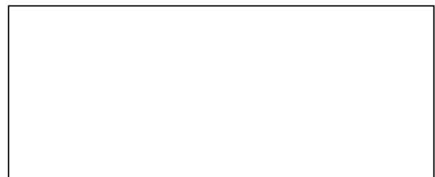
Fig. 1. A mortar barrel rupture

It should be noted that methods of increasing the strength of the barrels are not exhausted [4].