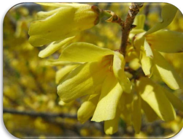
Fig. 2. Flowering of Forsythia Ovata on the territory of the VNAU biostationary

A characteristic feature of Forsythia Europaea is the availability of two orders of shoots branching and two periods of growth. The first, most intensive period of growth, ends in the third decade of June, and the second – in the second decade of July. A valuable biological feature of Forsythia, for which they are used in landscaping, is their annual and abundant flowering [7]. Forsythia Europaea has golden flowers with short petals, gathered in axillary drooping tassels. The tassels are formed in the axils of the upper pair of leaves that have grown into a disk, and sometimes each whorl of six flowers has its own disk. Among all the types of Forsythias that were studied Forsythia Ovata breaks into blossom the latest (Fig. 2).