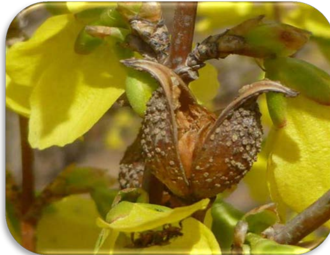
Fig. 3. Fruiting of Forsythia Ovata (VNAU biostationary)

In Vinnytsia conditions the fruits of Forsythia Suspensa , shown in Fig. 3, ripen later than all (the end of April – the end of May).