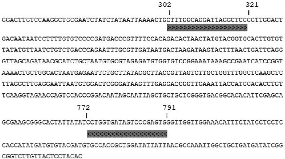
Fig. 1. Localization of primers hybridization sites on the DNA consensus sequence of the P75 gene matrix of BNYVV

The calculated optimum temperature primers annealing for Forward primer is 58.47°C and for Reverse primer is 59.25°C, percentage deoxyguanosine-5'-phosphate and deoxycytidine-5'-phosphate for Forward primer is 55% and for Reverse is 60%.