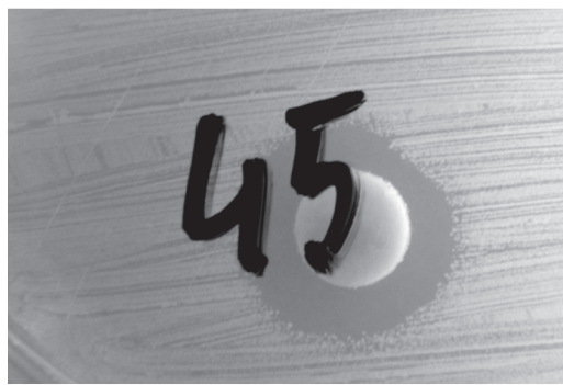
Fig. 2. Antimicrobial activity of ethanolic extract obtained from the leaves of Ficus lyrata against Staphylococcus aureus measured as inhibition zone diameter