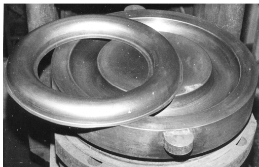
Fig. 3. General view of die and article “fairing” of 488 mm outside diameter from steel St3kp of 1,5 mm thickness

action (MDB) that allow to generate the optimized loading fields, which correspond to geometric parameters of a part. For example, during forming the part “fairing” (Fig. 3) that represents a half-torus, the load was applied only to the weighed-down segment of blank by connecting of corresponding electrodes of the installation UEHSh-2, excluding central zone where blank has round hole ac-