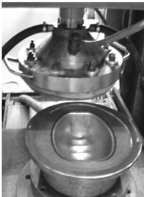
Fig. 2. Conical discharge chamber and tooling placed in technological unit of the installation UEHSh-2

aluminum alloys AD1M and 1080 in experimental installation UEHSh-2 (Fig. 2) two approaches to planning of forming process were tested. When using “classic” (traditional) approach the discharges of lower voltage of 13 kV were applied at the stage of forming of general shape, at the stage of forming of local elements – 14-15 kV, at the stage of calibration – 16 kV with capacitance of 50 microfarad. Total number of discharges was 8, total energy consumption – 42.2 kJ and main forming time – 74 s (8 charge-discharge cycles). When using nontraditional approach with higher voltage of 20-30 kV and less capacitance of 33.2 microfarad the required number of discharges reduced to two. At that total energy consumption was 21.5 kJ, and forming time decreased to 16 s that is comparative with parameters of traditional forming in the die-and-punch tooling on hydraulic presses.