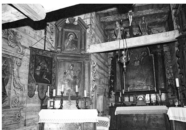
Fig. 4. Church interior from Rosolin. Transferred to Sanok Open Air Museum.