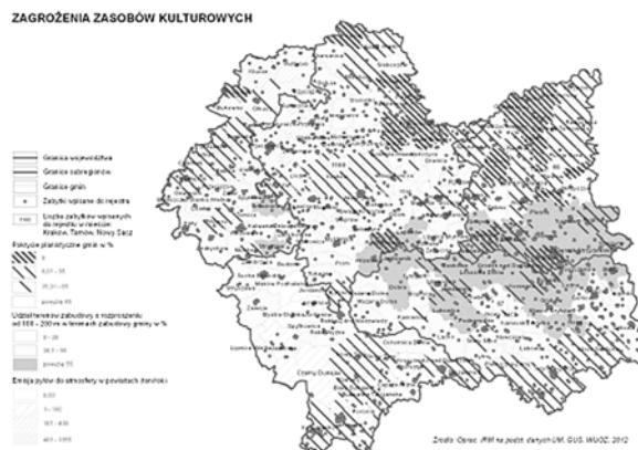
Fig. 2. Cultural resources. Threads