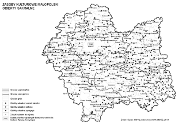
Fig. 1. Cultural resources of Malopolska. Sacral buildings