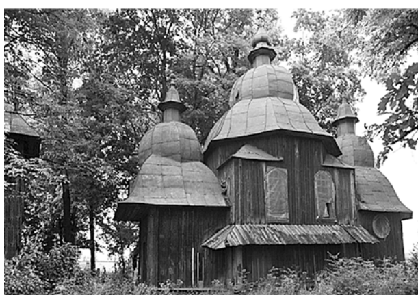
Fig. 3. Wooden church in Opaka, 2003, before fire.