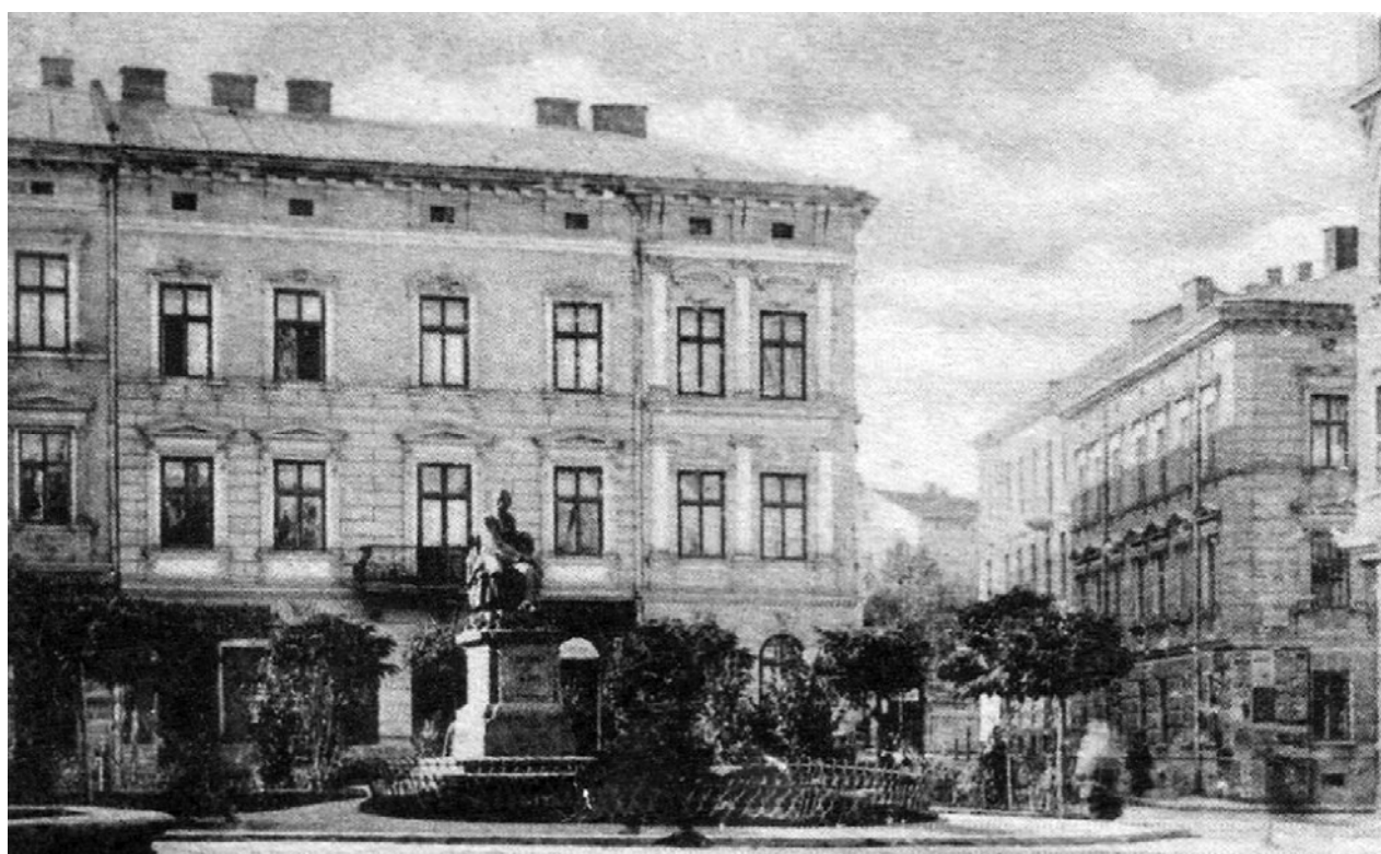
Fig. 3. Monument to the playwright Aleksander Fredro, Academic Square (Shevchenko Avenue), Lviv.

In addition to the park areas, the landscapes surrounding several monuments in the center of Lviv also belong to the authorship of Arnold Röhring. In 1897 in Akademicka Square (Shevchenko Avenue) a monument to the playwright Aleksander Fredro of Leonardo Marconi's authorship was set up. From the remaining photos it can be concluded that around the Fredro monument a round-shaped pedestrian zone was formed organized with three flowerbeds and trees. The flowerbed in the front side of the monument was fenced round with the same metal fence as the flowerbed on Hetmanski Valy (Hetman's Ramparts, present Svoboda Avenue). In the square, in front of the monument, a view of Akademicka with a silhouette of the bell tower of Latin Cathedral is revealed.