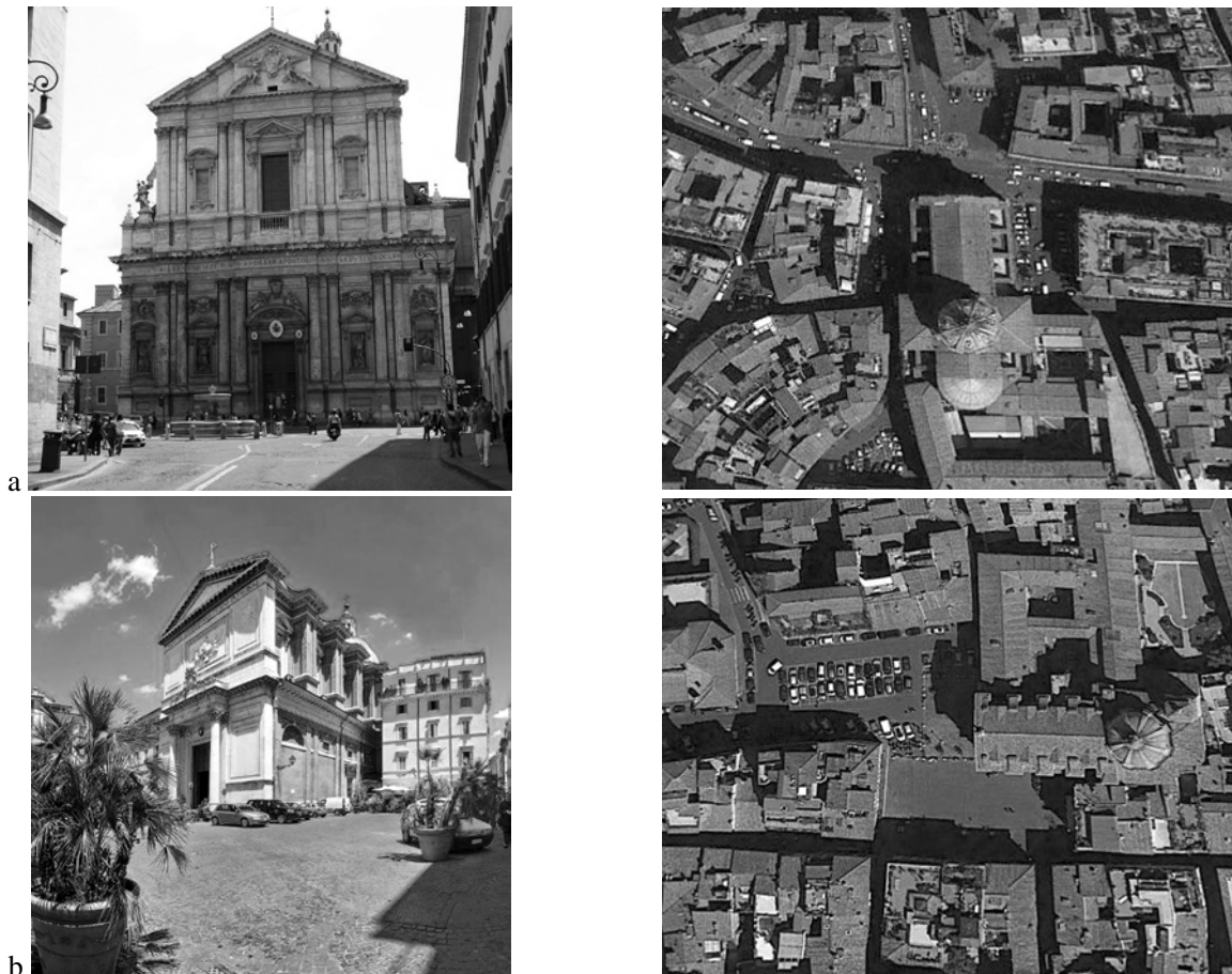
Fig. 1. Examples of sacred squares arrangement: a – Church of St. Julian of the Flemings; b – Church of San Salvatore in Lauro

The experience of Italy, where the warm climate and dense urban development patterns are predominant is worth mentioning here. For example, in Rome, at the end of the nineteenth century, there are 255 churches and 21 of them are attached on one side; 96 – attached on both sides; 110 are attached on three sides; 2 attached on four sides and only 6 are free standing ones (Sitte, 1889). This arrangement of objects of sacred architecture has proved itself as the one having more positive features of their perception by the viewers. The church view is opened only from the “correct” side, creating a unique perception pattern. These visually limited areas provide an opportunity to focus on spiritual qualities: Church of St. Julian of the Flemings; Church of San Salvatore in Lauro; Church of Santa Maria Maddalena (Fig. 1). And the Church of Sant'Ivo alla Sapienza can only be seen from the courtyard (Fig. 2).