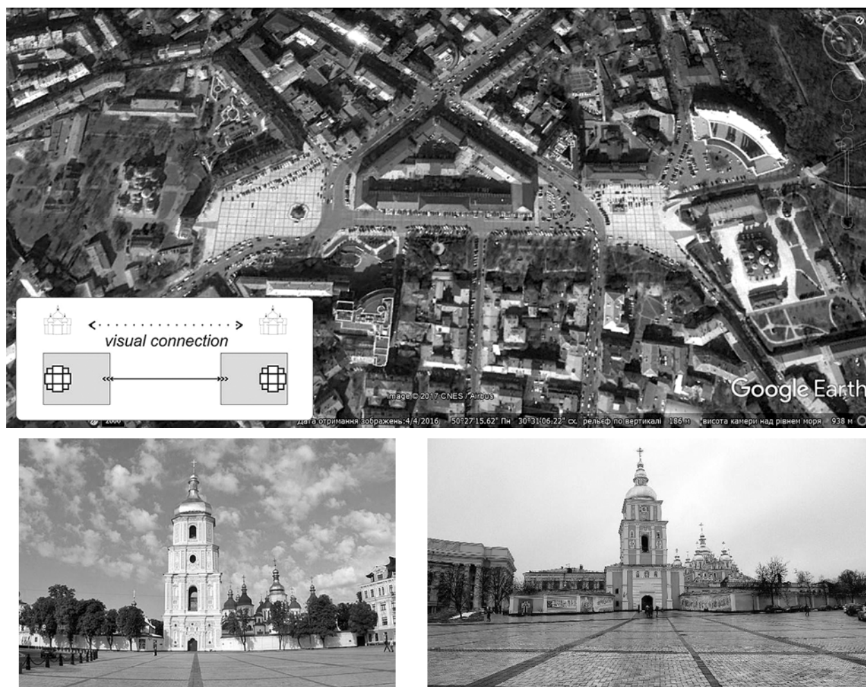
Fig. 5. Organization of the sacred space of St. Sophia Cathedral and St. Michael's Golden-domed Monastery in Kyiv.

While forming the spatial structure of historical cities, the streets were laid in the direction to its dominants – the sacral objects. Thus, the facades of the surrounding buildings create a foreground that led the viewer's sight to the temple, thereby enhancing its significance, and the street gains a compositional perfection (Koznarska, 2011). Combination of several sacral spaces into a single compositional structure provides a sound basis for shaping the image of the city. Thus, the image of Kyiv is formed on the basis of a sacral center which includes two sacral complexes: the St. Sophia Cathedral and the St. Michael's Golden-domed monastery, the sacral squares of which are connected by Volodymyrsky Avenue (Fig. 5).