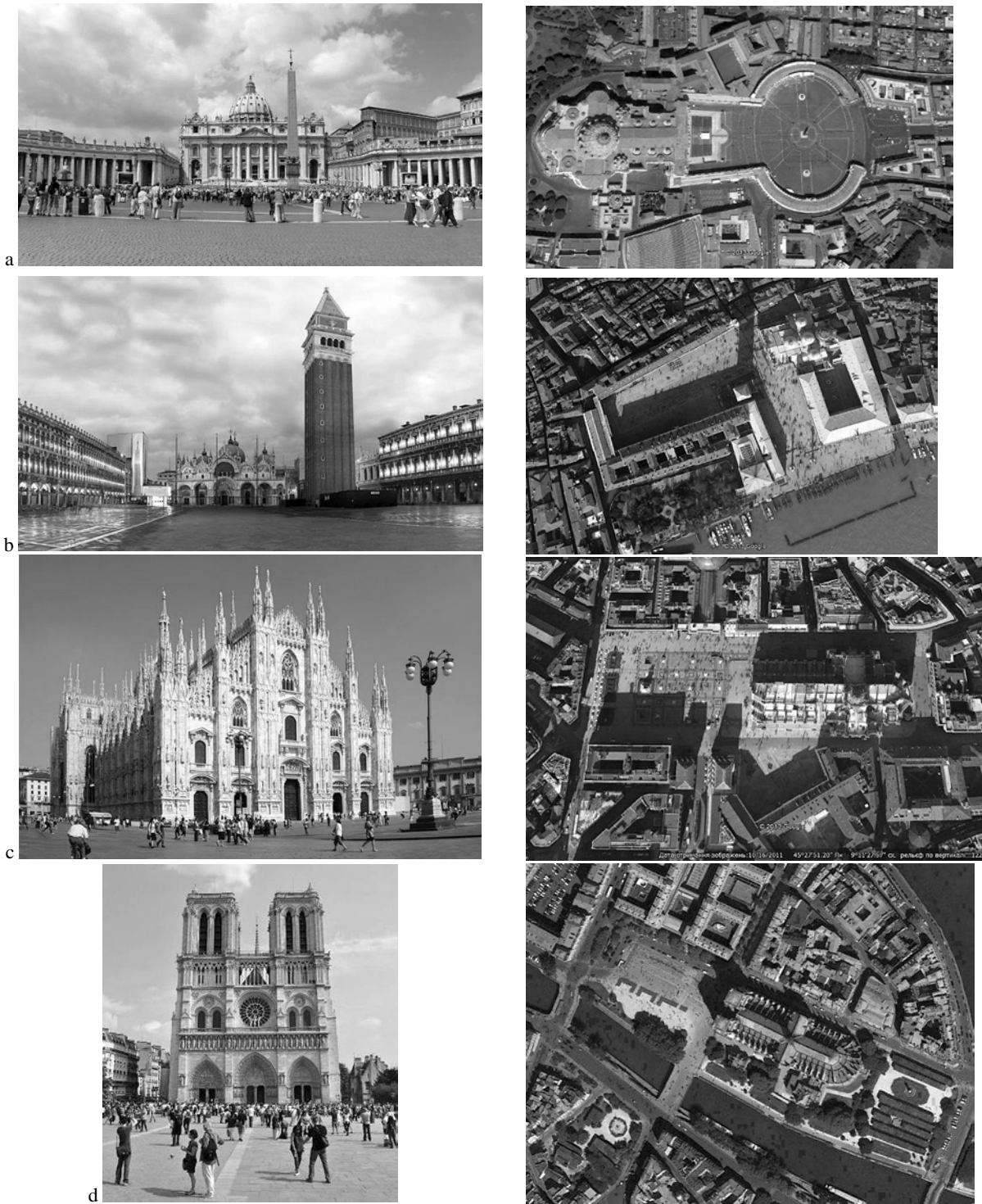
Fig. 4. Examples of sacred squares arrangement: a – the Cathedral of St. Peter in Rome; b – the Cathedral of St. Mark in Venice; c – the Cathedral of Milan; d – the Cathedral of Our Lady of Paris.

If we analyze the most magnificent churches in Europe: the Cathedral of St. Peter in Rome, the Cathedral of St. Mark in Venice, the Cathedral of Milan, the Cathedral of Our Lady of Paris, etc., it should be noted that the sacral space of their squares is resolved flawlessly from an aesthetic point of view and enhances the greatness and the weight of the temple. According to the theory of vision, for the best perception of the object of architecture, it is necessary to provide an optimal vertical angle of 27 degrees view (that is a distance equal to two heights of the object) (Koznarska, 2014). Actually, these principles, in this case, are clearly elaborated, therefore, in front of the main facade there is an elongated square from which you can examine all the greatness of architecture (Fig. 4).