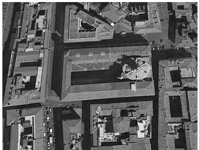
Fig. 2. Church of Sant'Ivo alla Sapienza and the courtyard.

The arrangement of the area not along the main axis but perpendicular to the axis of the church offers a spectacular view of the site. In this case, we have the opportunity to observe the main facade only at a certain angle: the church Sant'Agnese in Agone, which looks on Piazza Navona (Fig. 3).