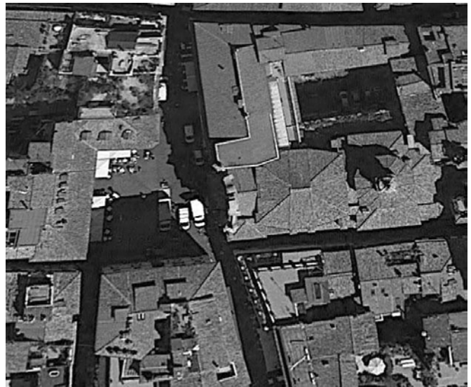
Fig. 1. Examples of sacred squares arrangement: c – Church of Santa Maria Maddalena.