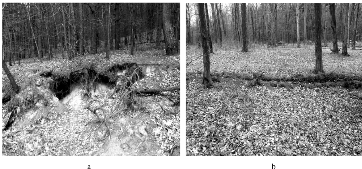
Fig. 3. The degradation of the Bryukhovitsky Forest Park: a – erosion processes in the forest park area; b – the unauthorized arrival of vehicles in the forest park area (H. Lukashchuk, 2016)

However, despite the significant transformation of the territories of the forest parks, species of vascular plants that are included in the Red Data Book of Ukraine are preserved in their territories. In most cases they are spring ephemerals. The prevalence of the forest species and the presence of rare species is evidence of a high level of sustainability of natural forest ecosystems. At the same time, the formation of specific groups of spontaneous vegetation within the forest parks on the outskirts of Lviv depends on the intensity and nature of the use of the territory. The vitality of phytocenoses of forest parks is negatively affected by soil redevelopment. Excessive attendance leads to a violation of the links between the components of the forest, the loss of resistance to the forest planting, and in some cases – to its complete disorder (H. B. Lukashchuk, T. A. Fedorchuk, 2015). Typical vertical structure has survived in plantations, which by origin and composition are indigenous (Vynnyky forest park, Pohulianka forest park). Differentiation of the first and second wood tiers, brushwood, undergrowth and grassy tiers is observed as well.