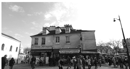
Fig. 4. Archaic legendary structure, Montmartre in Paris.

In this sense, the strategy of legendary structure acts as a three-component system of views consisting of archaic level – finding and updating of historical, symbolic, and religious aspects.