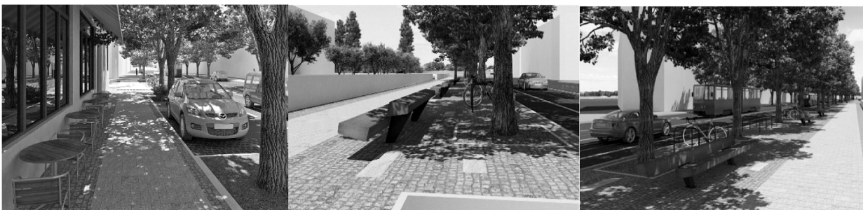
Fig. 3. Project proposals for the reconstruction of the Bandera street, project of 2017, [9].

Thus, for the construction of city-transforming impulses for the development of a post-industrial city, the universal factors of the rapid growth of urban fabrics, should be divided into two parts. One of them can be