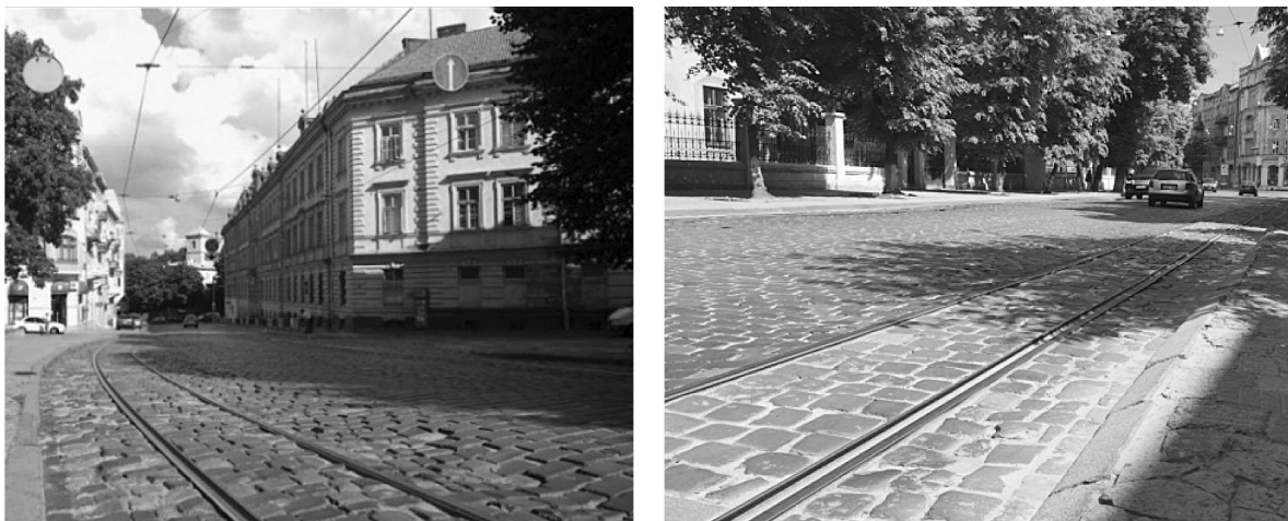
Fig. 2. The present condition of the road surface from the pavement side, Bandera street, 2018, [9]

If such competition was restricted from radical forms of confrontation and limited to the non-aggressive manifestations, the motivational quality of the 'legendary' factor could be a source of additional growth of the city's activity. However the motivational factor can act most effectively in the case of opposition to the city structure. Such an opposition is already an important element of the city-wide discourse around important issues of its infrastructure development (for example, discussions around the reconstruction of Bandera Street in Lviv in 2016–2017, when all the participants turned to examples of a competing for a “different” city –the one without a cobblestone and the one where it is partly preserved).