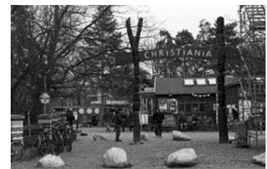
Fig. 6. Communicative legendary structure, Christiania in Copenhagen, [14]