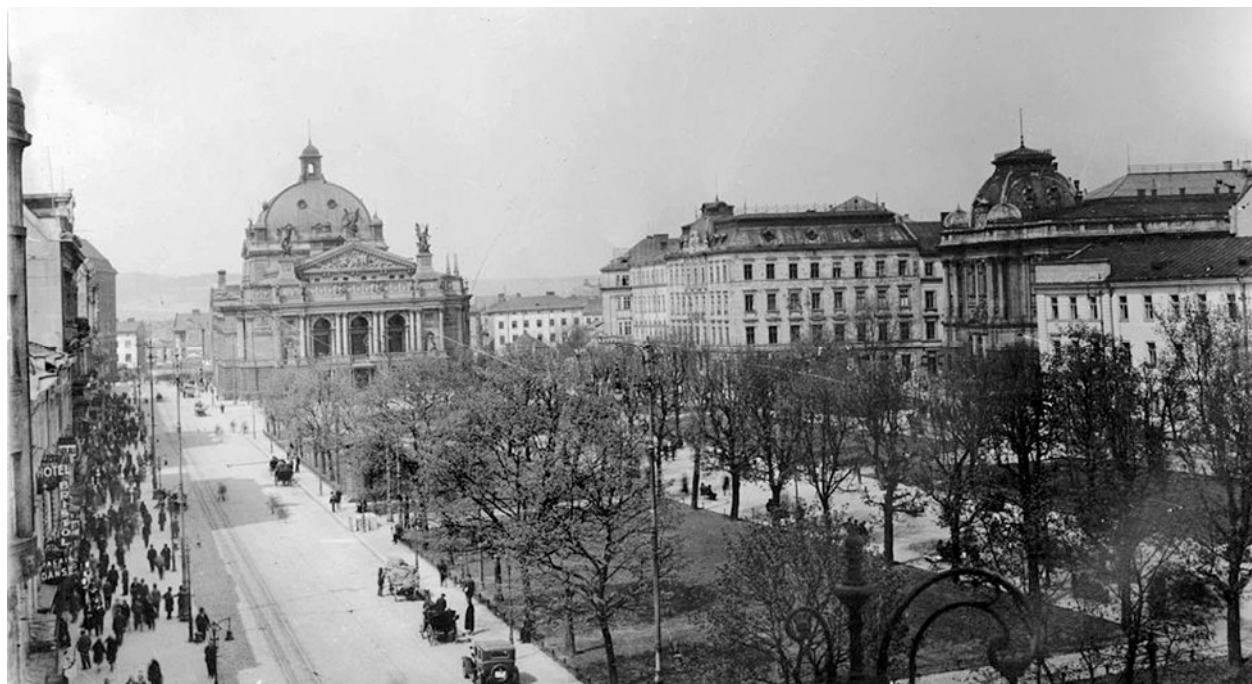
Fig. 1. The view on Karl Ludvig Avenue (today – Svobody Avenue) on Hetmanski Valy in Lviv. Photo of early XX century

In urban spaces forming natural features played an important role: putting Poltva River into the collector and creating Karl Ludvig Avenue (today Svobody Avenue) on Hetmanski Valy created compositional axis, which stretched to the newly built city theatre and continued along the underground river Poltva (today Shevchenko Avenue) (Fig. 1). Hetmanski and Hubernatorski Valy became the planning basement for Boulevard Ring – “Lviv’s Corso” like in European cities – “Krakiv’s planty” or “Ring in Wien”.