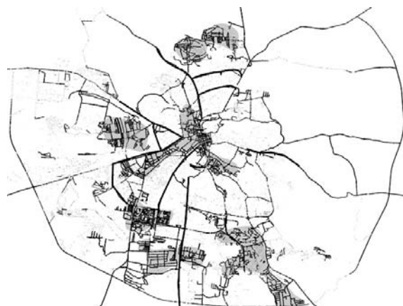
Fig. 4. Areas of the city, that have received impetus to the high-quality development despite the priority of Lviv street network pieces.