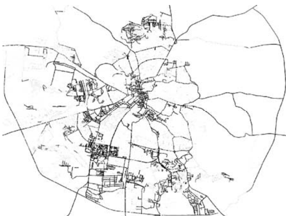
Fig. 3. Preferred fragments of the city street network.