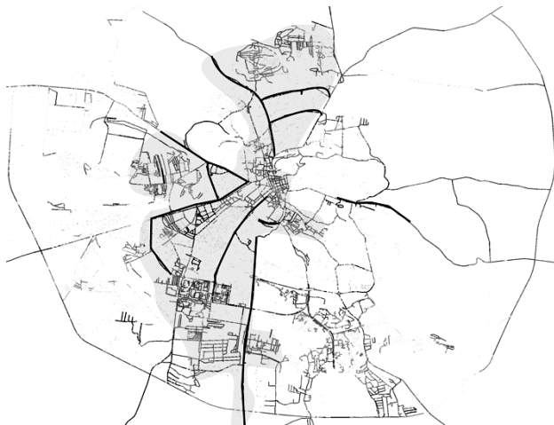
Fig. 5. Territories that will rapidly develop on the basis of street network potential by B. Hillier's theory.

Monitoring the event activity in the city also confirms the B. Hilliers theory about priority spaces of the city and their dependence on the geometry of the street network. The most significant events in the city, both of cultural and commercial nature, and social actions are held in spaces along the streets with the lowest angles of rotation as well as with the nearby streets of the smallest grinding.