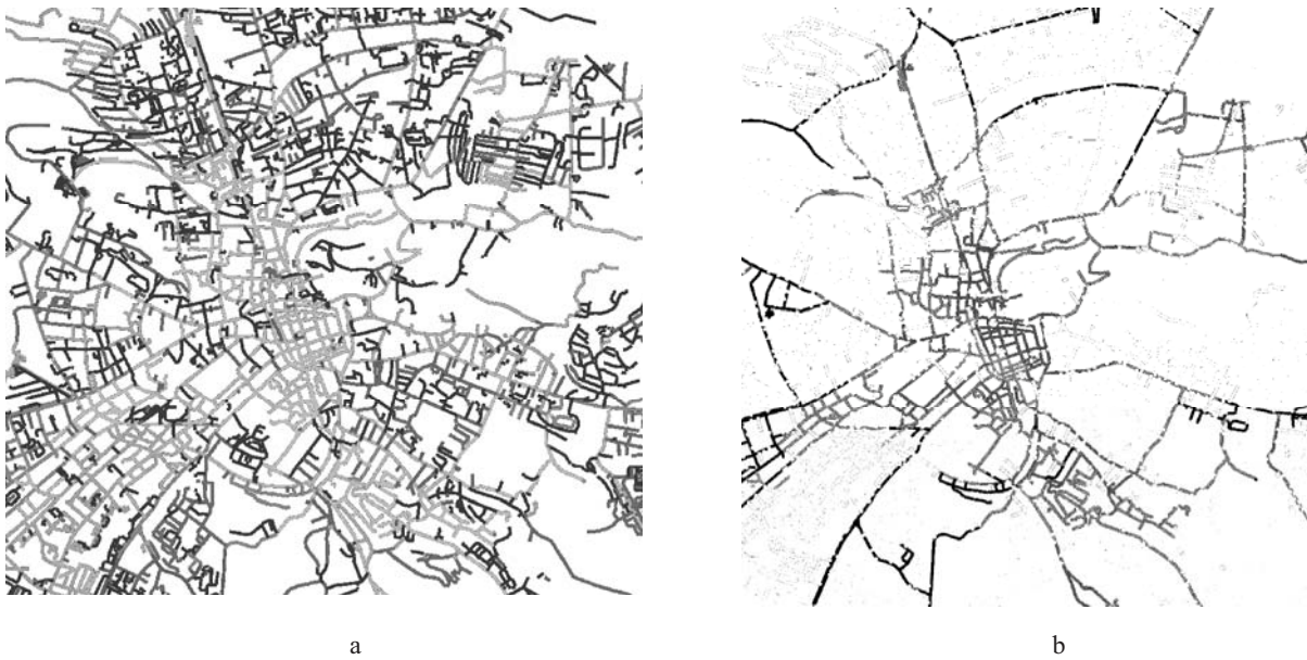
Fig. 2. Street network of the central part of Lviv city: a – a common network, b – identified as “prior spaces” according to the B. Hilliers method.

means depth). It is defined that the criteria for “priority space” by B. Hillier in Lviv is the rectangular network of streets at the Market Square and the area around it (Fig. 2, a, b). As well as the space, that has the potential to develop, highways of the city importance are distinguished. That was expected to radial city (Fig. 3). Areas of apartment buildings of 60s-80s are the “patches” in the structure of the city with more resources to development and complications (Fig. 4). This definition is confirmed by the density of these areas with new buildings, especially with new functions. So that Sykhiv, Levandivka, Shchurata streets have had the built-of shopping centres, markets for fifteen years. The first floors of residential buildings have completely been passed into the various types of business. In addition, density of areas usage in these regions has increased, also mainly because of open-typed trading facilities and cafes. In general, the nature of the network of “priority spaces” in Lviv has the patch nature, combined with the centre with the use of radial directions (Fig. 5).