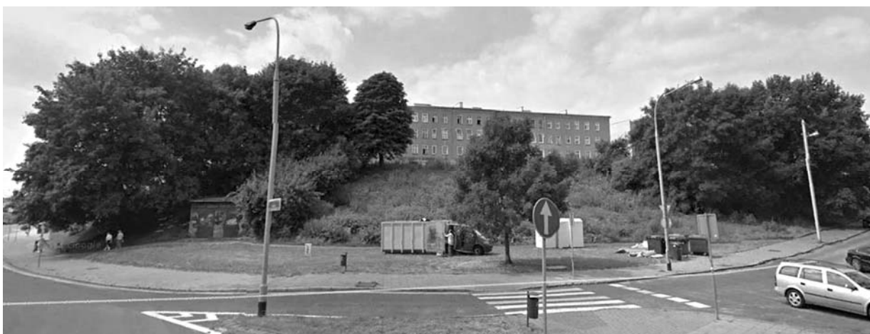
Fot. 5. The top picture illustrates how lots of areas look in Poland after the law has come into force. The bottom picture shows how the same place looked before the trees were cut down.