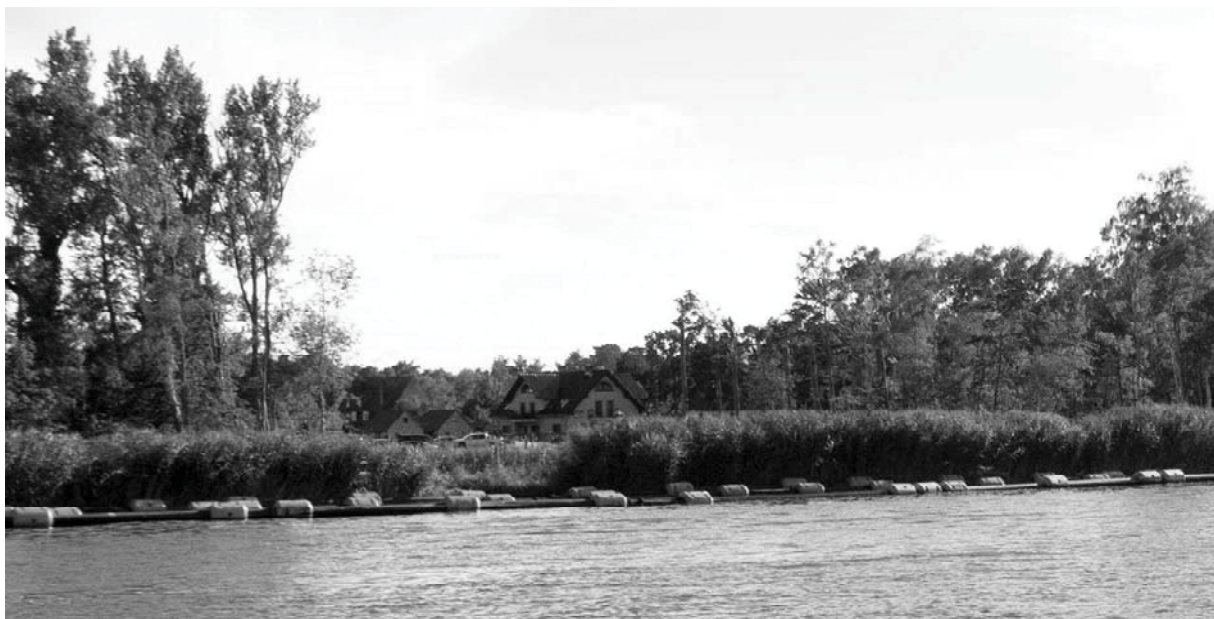
Fig. 4. The studied area in which the trees were cut down.

The adopted law allows to cut down the trees on a private property, and has led to its thoughtless increase as people do not check whether the area has a local plan of spatial development, which prohibits the removal of trees or is protected by Natura 2000 . It should be developed in the inspection of land use conditions and directions of municipality.