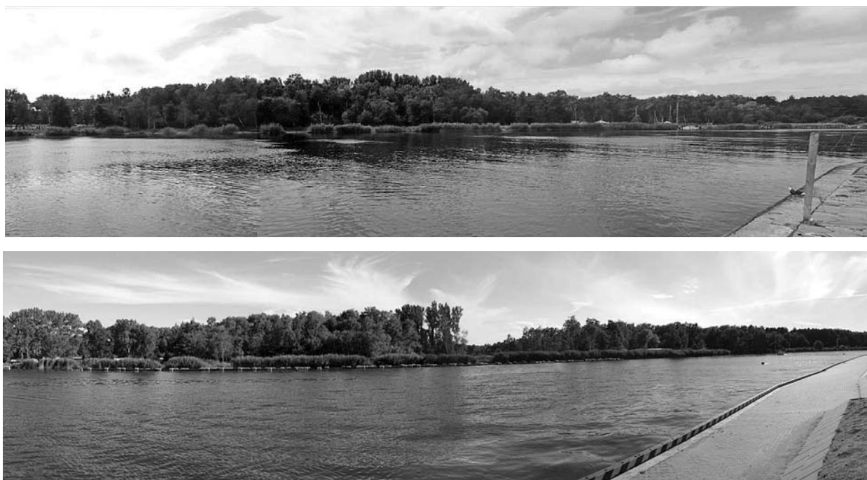
Fig. 3. The panorama of the Natura 2000 protected area. The top photo shows the 2011 look, the bottom illustration shows the 2017 image after the trees are cut. The square indicates where the landscape has changed.

The area shown in Fig. 3 is the example of devastation of high greenery, caused by the adoption of irresponsible law. How the area looked in 2013 shows the top picture of Fig. 3. After the clearance of trees that took place in 2017, the view is shown in Fig. 3 below. The trees formed a harmonic landscape which influenced the microclimate and gave the survival of bird habitats.