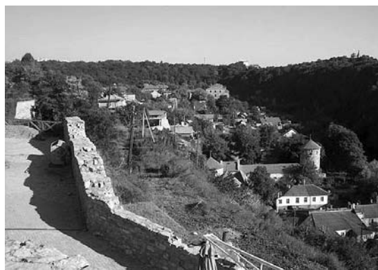
Fig. 1b. The illustration shows foreground with a further panorama, Ukraine.

One part of the study covers the selected area (Fig. 2, 3), and it is conducted on the basis of extensive field analysis. It was elaborated over several years and is related to the selected real estate and legal conditions. The basis was the study of the places where the landscape was altered by thoughtless but agreed by the law clearance of trees. The aim of cutting down the high greening was primarily to receive profit, and not the issues of threat to the environment or care for space. This kind of trees clearance would be acceptable in case it concerns safety of people or introduction of any kind of public space, however it was not the case.