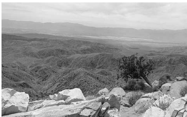
Fig. 1a. The illustration shows a foreground with a further panorama, The Joshua Tree National Park, United States.

species in turn of the removal of high green trees. In most cases it was a fixed amount of money to be put into a municipality account, or a person had to plant a sufficient number of new trees. Cutting down one or several trees has usually resulted in need to plant dozen or so or several dozen of trees. Depending on the species, size of the trunk and the age of a tree, amount of money paid to a municipality could reach even several hundred thousand and even millions of Polish zlotys. There were also situations in which no agreement was reached in cutting trees. (USTAWA, 2004)