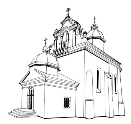
Fig. 4. St. Nicholas Church, Zolochiv, graphics by A. Tyrpych, 2015