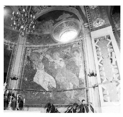
Fig. 5. Polychrome paintings by M. Sosenko (1911–1913), photo by V. Radomska, 1991