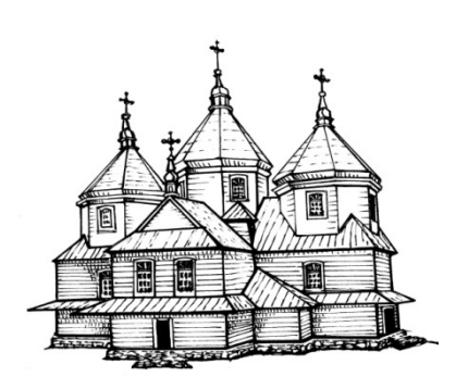
Fig. 7. Church of Resurrection of Christ, Polyany, graphics by A.Tyrpych, 2015

Church of Resurrection of Christ, located in Polyany village (Rykiv village till 1946), Zolochiv district, Lviv region, was designed by the architect V. Nahirnyi and dates back to 1903. In 1913–1914, Modest Sosenko created icons for the iconostasis and the two side altars and painted the central dome of the nave (Fig. 7–9).