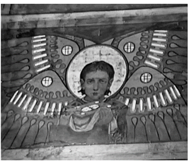
Fig. 8. Polychrome paintings by M. Sosenko (1913–1914), photo by A. Tyrpych, 1991