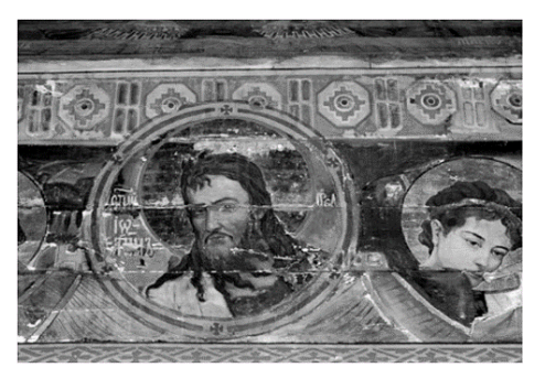
Fig. 9. Polychrome paintings by M. Sosenko (1913–1914)