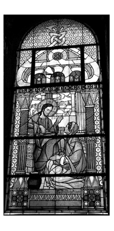
Fig. 3. Arch. Michael Church, Pidberiztsi; stained-glass window, northern wall of apse; photo by A. Tyrpych, 2005

St. Nicholas Church in Zolochiv, Lviv region, is the architectural monument of the XVIth century, which back in the past used to be a part of the defensive constructions of Zolochiv in Hlynianske suburb. The defensive features of St. Nicholas Church are preserved nowadays and include thickness of walls, window apertures, fittings, etc. The construction started in the XVIth century and finished in the early XVIIth century; its founder is Mykola Vasyl Pototskyi; the church was restored in 1765; the sculptor of the stone plastic arts on the church facade is Frantsisk Olenskyi; the author of polychrome paintings of 1911–1913 is Modest Sosenko (Hupalo, 2007, p. 12–15). The inscription states that back in 1911–1913 the interior space of the church, namely murals, was fully reconstructed and restored. The task was assigned to Modest Sosenko, who created the new conception of decorating spatial composition of church interior with the help of polychrome paintings and followed the traditional for him idea of combining Neo-