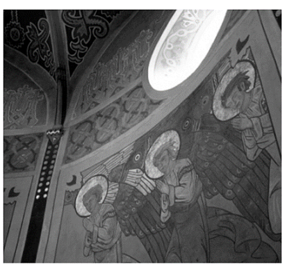
Fig. 6. Polychrome paintings by M. Sosenko (1911–1913), photo by A. Tyrpych, 2013

Church of Resurrection of Christ, located in Polyany village (Rykiv village till 1946), Zolochiv district, Lviv region, was designed by the architect V. Nahirnyi and dates back to 1903. In 1913–1914, Modest Sosenko created icons for the iconostasis and the two side altars and painted the central dome of the nave (Fig. 7–9).