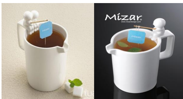
Figure 1. There are examples of the persuasive design of Mizar's for tea advertising (2017)