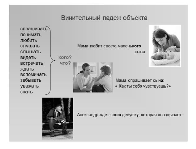
Fig. 1.4. Table of verbs to be used with accusative case

At the present moment the teachers of the Department of Philology are developing a basic distance learning course which includes 10 subjects. The duration of learning the course makes up 10 weeks. Apart from the materials used in the introduction of phonetics (Audio presentation «Listen, repeat», grammar tables, training exercises, control work), there have appeared some new tasks that allow students to come to a new level of communication, and some new educational tables which help them to understand the meaning of every phenomenon (Fig. 1.4). Viewing of selected fragments of an unadapted cartoon with «before viewing» and «after viewing» tasks designed for each fragment is suggested. In comparison with other educational media cartoons feature some peculiar agility as an advantage. This is explained by the fact that the space-time relations between the objects and scenes make the students think synthetically. While describing and narrating the student should not only know how to build correctly the separate sentences, but also pay a lot of attention to the inter phrase connections. It is important that the students can hear the Russian speech in authentic situations. The amplitude of phonic and auditive information facilitates content understanding; causes a desire to experience independent speech activity.