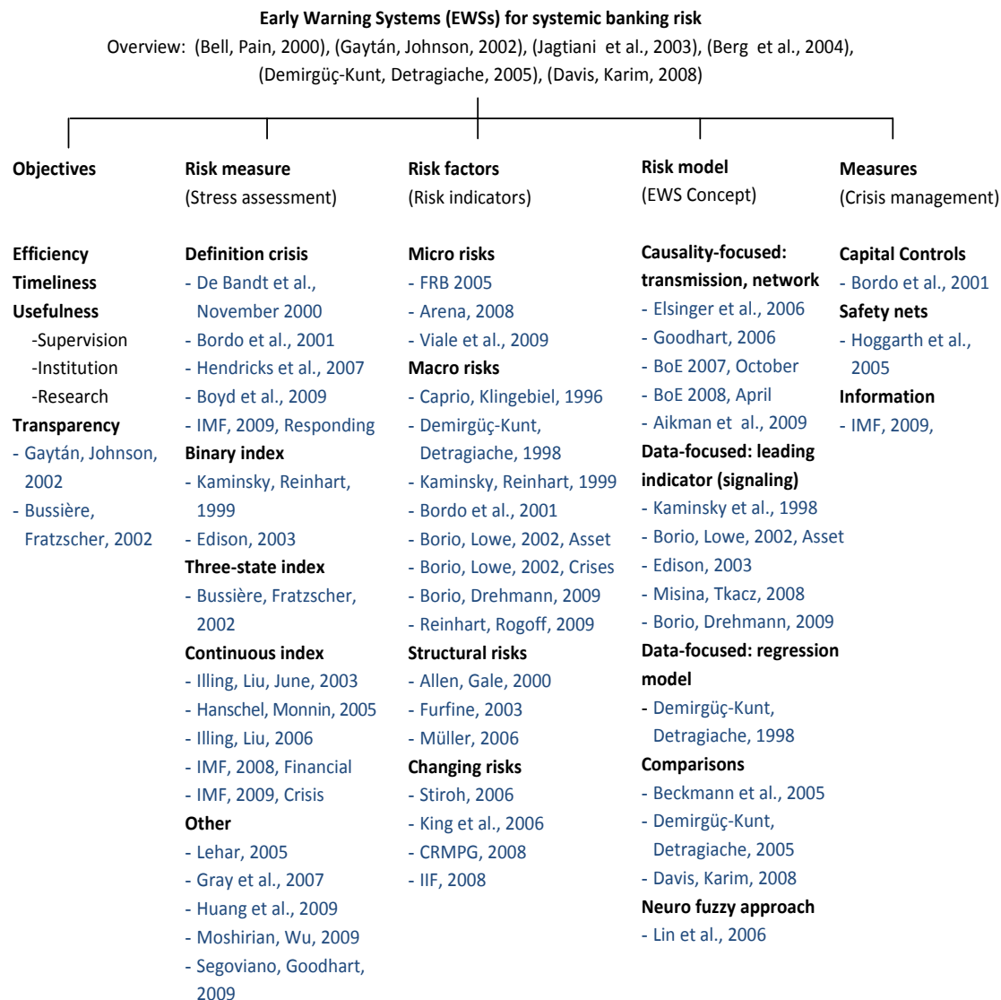
Fig. 1. Key elements of early warning systems

comes of the EWS and the objectives of its user. Gaytán and Johnson (2002, p. 3), and Davis and Karim (2008, pp. 89, 118) emphasize the need for clarifying the user's objectives in order to model the EWS in a consistent way. De Bandt and Hartmann (2000) point out connections between crisis definition and regulatory policy 2 . As a consequence, in modelling EWSs, special emphasis should be laid on putting together different elements in a comprehensive, integrated framework. An overview of EWSs' key elements and the related literature is shown in Figure 1.