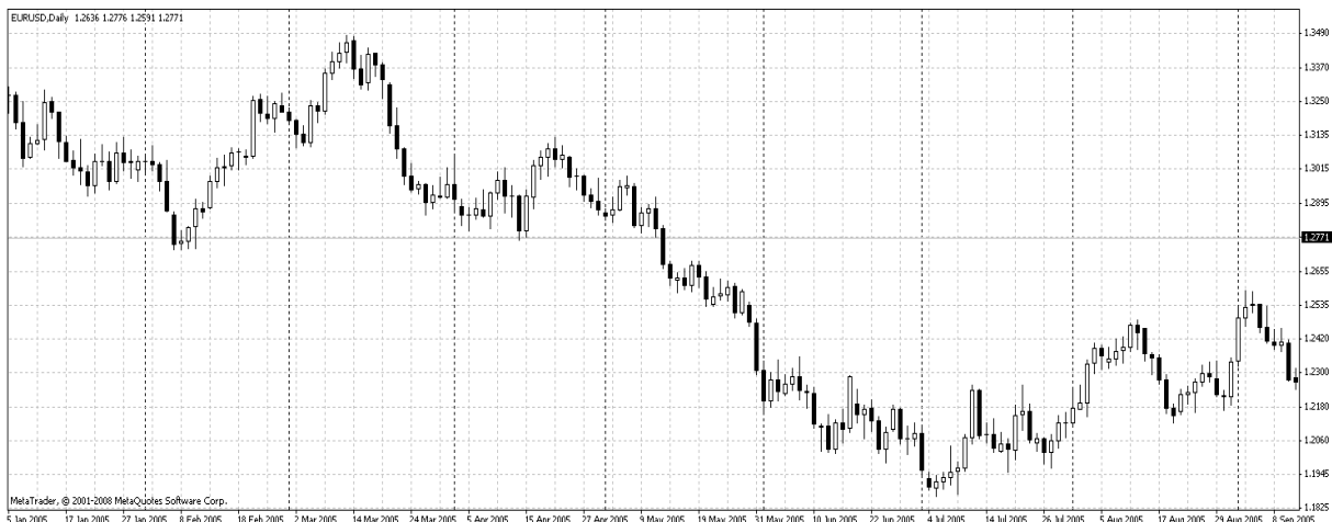
Fig. 3. The daily chart of EUR/USD quotes in 2005

However, the comparison of the same exchange instruments, in the year of 2005 gives a completely different picture (Figures 3 and 4) [3].