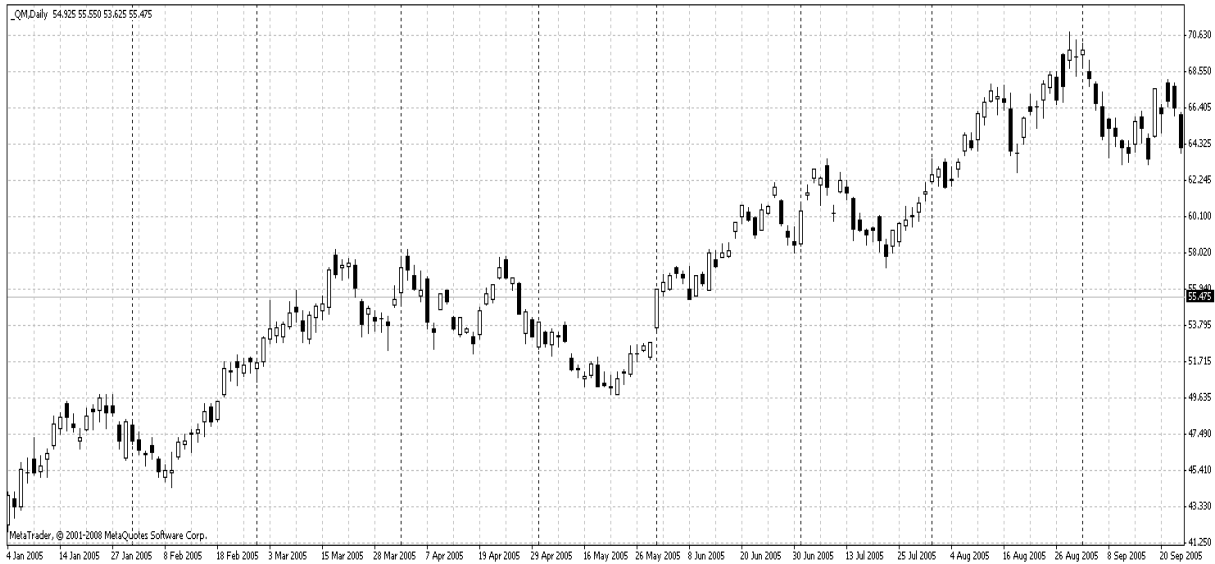
Fig. 4. The daily chart of prices for oil in 2005

As we see, the focuses of the market are not constant and shift from time to time. As an analysis tool we will use the pair correlation analysis, because it is better and more objective than a simple comparison of two charts of instruments, and allows to appraise in figures this “focus” of the market, figuratively speaking – the force of market’s concentration on something.