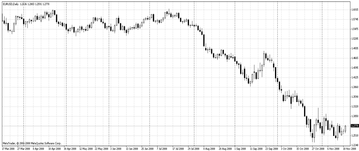
Fig. 1. The daily chart of EUR/USD quotes in 2008

year – on gold, 2 years later – on the stock market and so on. As a visual illustration of the proposed hypotheses, we will show the daily chart of oil and EUR/USD in 2008 (Figures 1 and 2) [3].