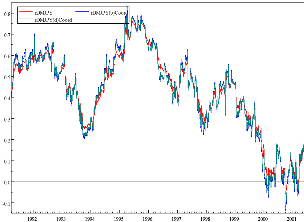
Fig. 3. Dynamic conditional correlations of the DM(EUR)/USD and the JPY/USD returns, including those from columns (b) and (d) of Table 5

These results could be of great importance for central banks' decisions on conducting coordinated interventions in a currency. According to these results if central banks wish to reduce exchange rate volatility, then it is preferable to intervene in coordination with only one another central bank and not in coordination with another two central banks; if intervention occurs in coordination with more than one another central bank it will not have the anticipated outcome. If a central bank wishes to affect its exchange returns it