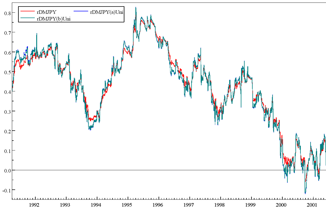
Fig. 4. Dynamic conditional correlations of the DM(EUR)/USD and the JPY/USD returns, including those from columns (a) and (b) of Table 6

2.5. Robustness analysis. Having found evidence that unilateral interventions are more productive as opposed to coordinated interventions of 2 or 3 central banks under the G4 assessment, as the former affect returns and in minor cases reduce volatility, in this section several robustness checks are being performed. In order to check the robustness of the results regarding the impact of the