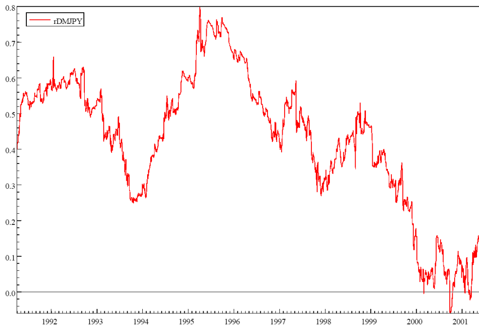
Fig. 2. Conditional correlations of the DM(EUR)/USD and the JPY/USD returns

The DCC model seems to perform very well in terms of capturing the DM(EUR)/USD and the JPY/USD exchange rate dynamics: (1) both exchange returns exhibit heteroskedasticity, based on the significant estimated coefficients of the individual GARCH models; (2) the conditional correlations of the DM(EUR)/USD and the JPY/USD returns are highly persistent as shown by the significant parameter estimates ( \alpha and \beta ) of the DCC GARCH model; (3) Li and McLeod (1981) test (which is a multivariate version of the Box-Pierce/Ljung-Box portmanteau test statistic for serial correlation) cannot reject the null hypothesis of no serial correlation on both standardized and squared standardized residuals, up to 20 lags; (4) the DCC model indicates that the correlations between these two returns are indeed time-varying. This can also be clearly seen in Figure 2, which plots the dynamic conditional correlation of the estimated DCC model in Table 4. The correlations during April 2, 1991 to October 19, 2001 vary between -0.05 to 0.8. Beginning from 1991, correlations between those two markets gradually declined till 1994, then there was an increasing trend till the mid-1995 followed by a declining trend till the end of 2000 when they became negative. Since the beginning of 2001, correlations varied around -0.05 to 0.2.