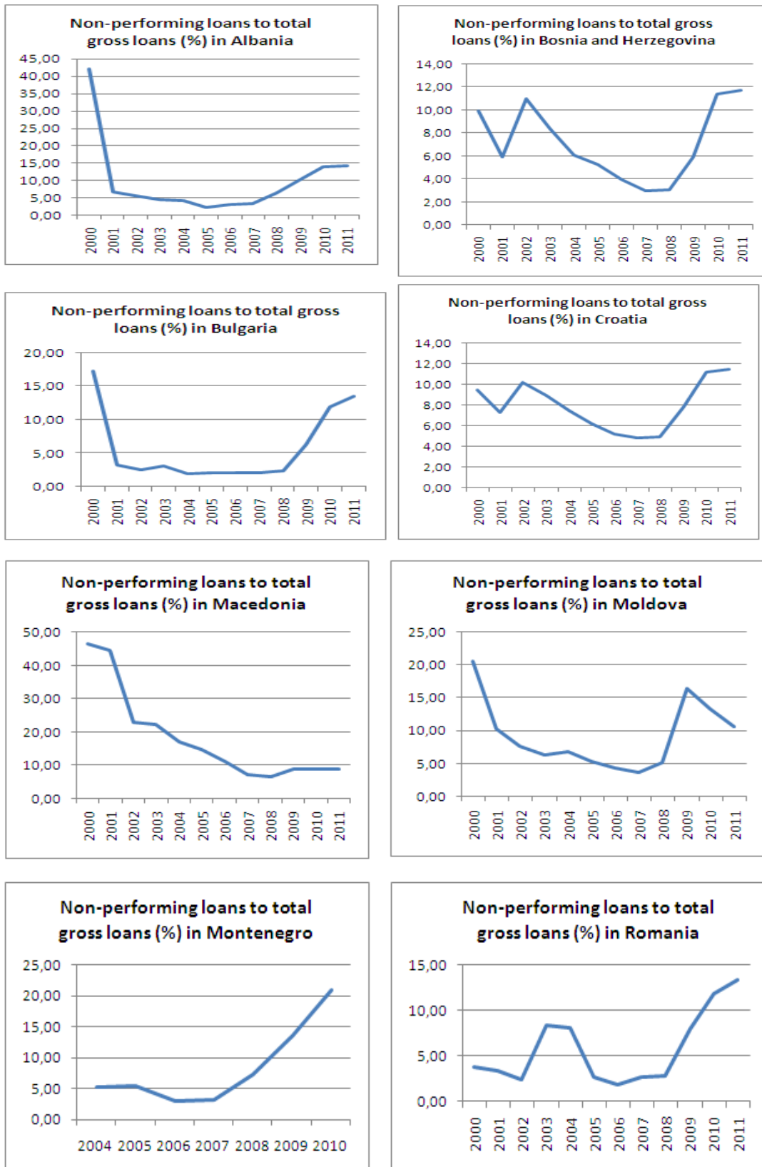
Fig. 1a. Non-performing loans to total loans in Southeastern European banking systems