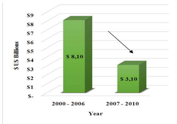
Fig. 3. Mean net income in US billions

Proposition (3) was tested using inferential statistical tests, which consisted of simple linear regression and ANOVA tests. Table 3 presents the results of regression ROA and ROE on risk taking. The re-