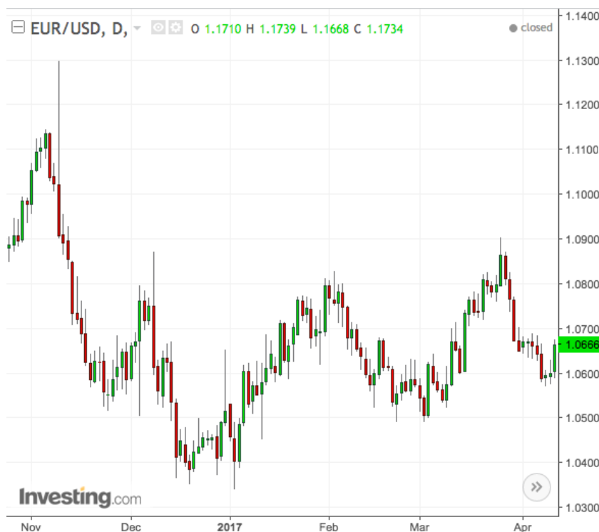
Figure 6. Dynamics of the EUR/USD pair from November 2016 to April 2017