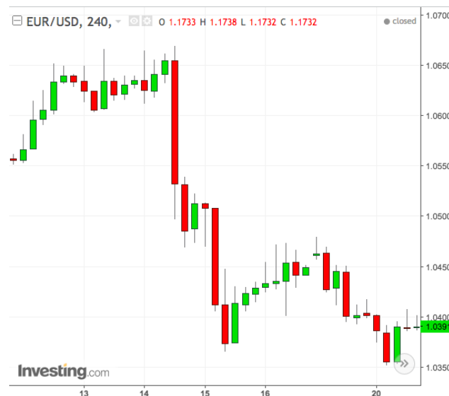
Figure 4. The impact of the increase in the discount rate of the US Federal Reserve (December 14, 2016) on the EUR/USD pair rate

Source: https://www.investing.com/currencies/eur-usd-chart