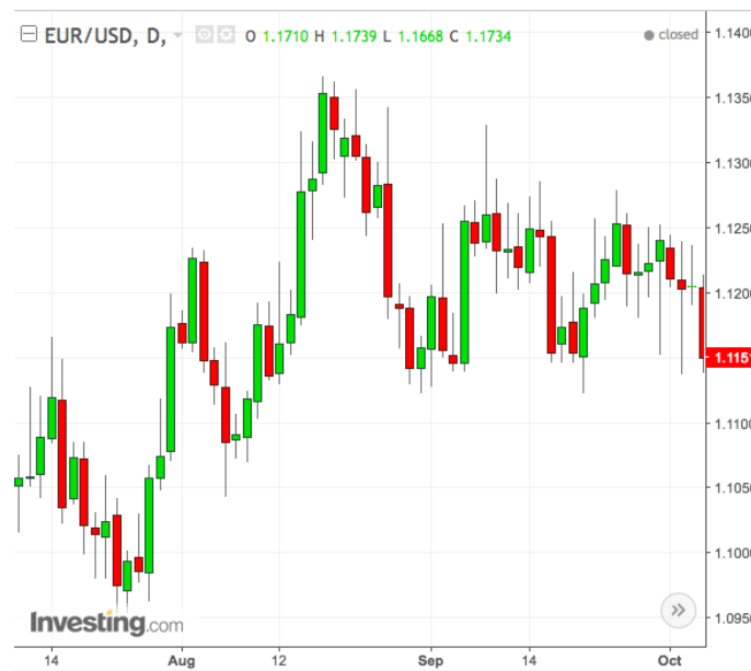
Figure 1. Dynamics of the EUR/USD pair at the beginning of October 2016