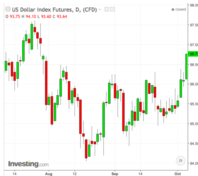
Figure 2. Dynamics of the dollar index at the beginning of October 2016