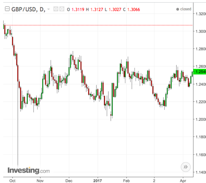
Figure 7. Dynamics of the GBP/USD pair from October 2016 to April 2017