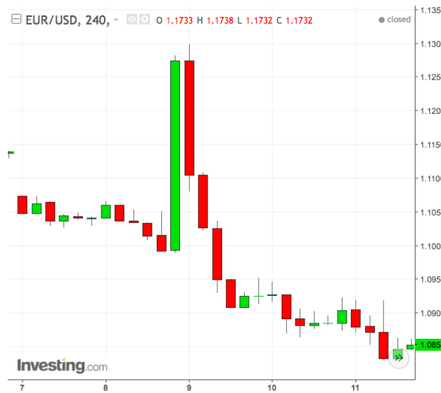
Figure 3. The EUR/USD pair rate jump on the day of the US presidential election (November 8, 2016)

Source: https://www.investing.com/currencies/eur-usd-chart