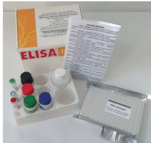
Fig. 2. Industrial sample of “IB-Chem Anti-Mycobacterium bovis” test system for diagnostics of cattle tuberculosis:

a — registration certificate of the test system; b — the set of components and instructions for the industrial sample