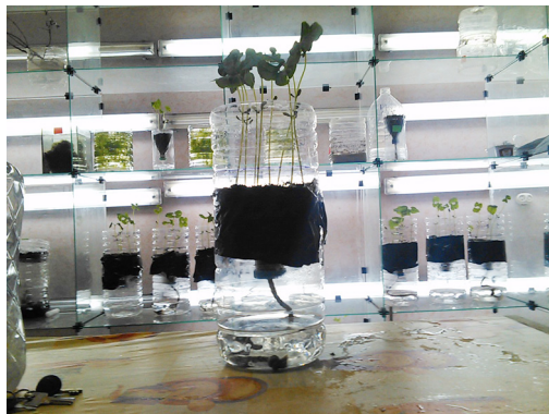
Fig. 1. Seedlings of Phaseolus vulgaris L. in microcosms on 14 th day after sowing

After determining the emission of gases in microcosms and morphometric parameters of seedlings, the concentration of organic carbon in aboveground dry weight of P. vulgaris was analyzed by the Tyurin method [14].