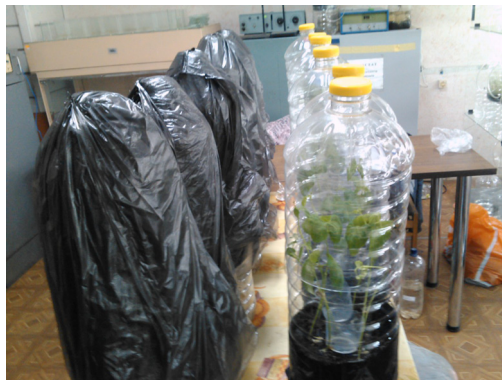
Fig. 2. Preparation of microcosms for measuring emission of gases

Рис. 1. Паростки Phaseolus vulgaris L. у мікрокосмах на 14-й день після посіву