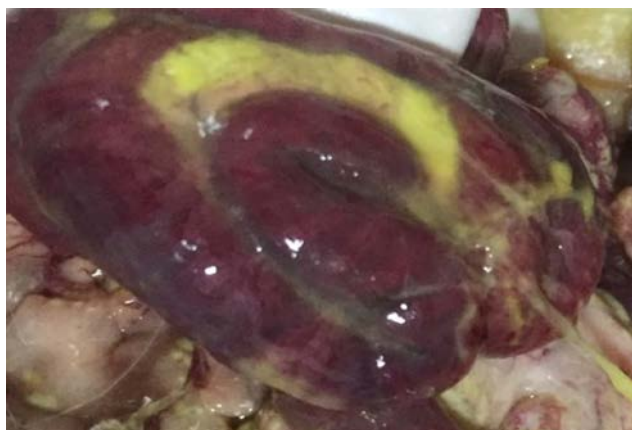
Fig. 2. The small intestine loop of the invaded rat with fibrinopurulent peritonitis