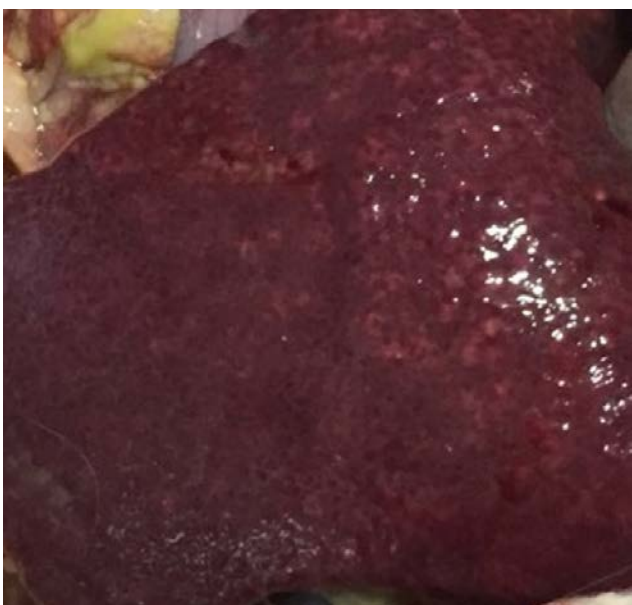
Fig. 4. Diaphragmatic liver surface of the rat with peritonitis. A large amount of micro abscesses is clearly visible

The color of the visceral lining of the intestines ranged from light pink to dark red with cyanotic discoloration. Minor dot and strip hemorrhages could be observed. Vascular branches vascularizing the intestinal wall were dilated, filled with blood, in contrast with the surrounding tissues. Symptoms of fibrinopurulent peritonitis were noticed in one sample (20 %) of the group I, 4 samples (80 %) of the group II and 5 samples (100 %) of the group III. The surface of the intestines is covered with grey-brown plaque, giving it a specific dimness (fig. 2).