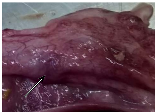
Fig. 5. Gastric mucosa of the rat invaded with Eustrongylides excisus larvae. Inflammatory processes are well-observed, stomach perforations are especially noticeable

Among the researched animals from the group II, that received injections of the 1 % hydrochloric acid solution in the amount of 0.5 ml via stomatogastric catheter and invaded with 10 nematode larvae each simultaneously, 19 living larvae the rats had been invaded by were discovered at the end of the experiment. What is