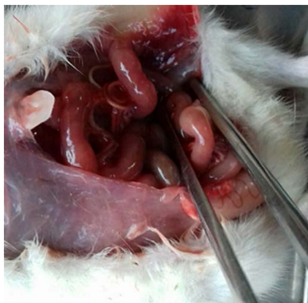
Fig. 1. The symptoms of diffusive peritonitis on the rat invaded with eustrongylidosis. Eustrongylides excisus nematode larva is clearly visible

The symptoms of this pathology were discovered in three samples (60 %) from the group I and in one sample of the group II. Autopsy discovered the E. excisus nematode larvae on the gastrointestinal canal, they showed vital signs (fig. 1).