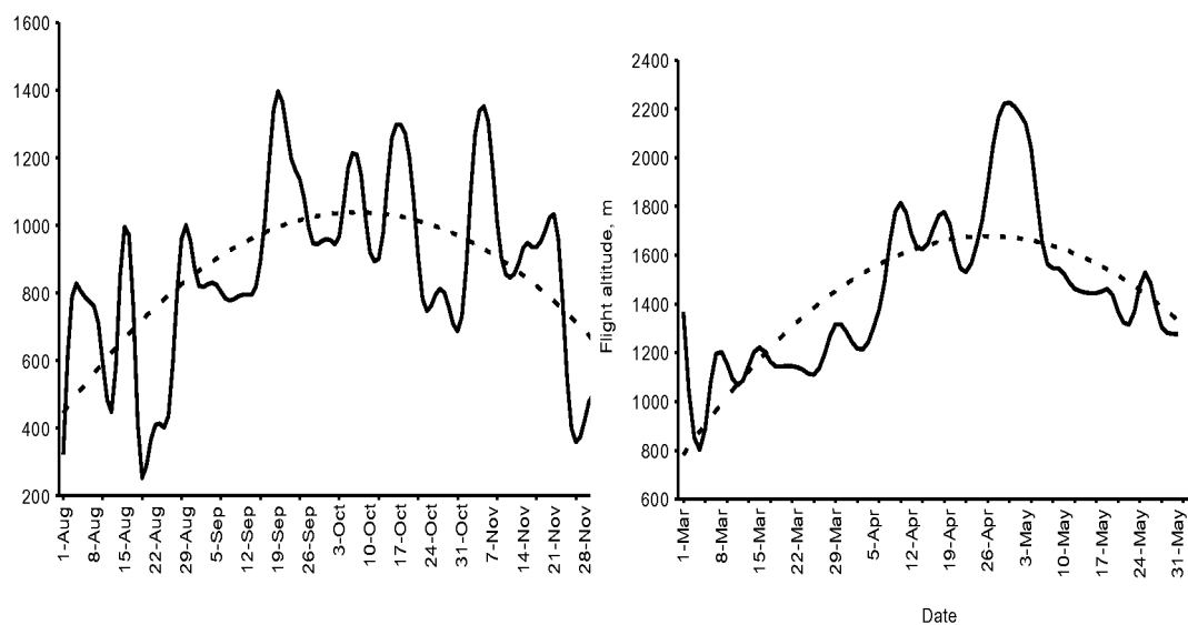
Fig. 1. The average flight heights of night bird migration in spring and autumn 1998-2000; dashed lines - the smoothed curves.

The probable reason for this change in the flight heights is the weather conditions. In spring, from March to May, the temperature of the atmosphere increases together with the temperature of a spreading surface; the level of tropopause sharply rises, and the positive convective streams are observed more often above the land. The influence of breeze processes plays an important role in the formation of steady convective streams above the land surface. During this period the sea is not sufficiently warmed yet. During daytime the land is warmer than the sea, in the first half of the night the contrasts of temperatures between the sea and the land are never equal. These factors lead to the unstable stratification of the air temperature above the land and cause the airlift.