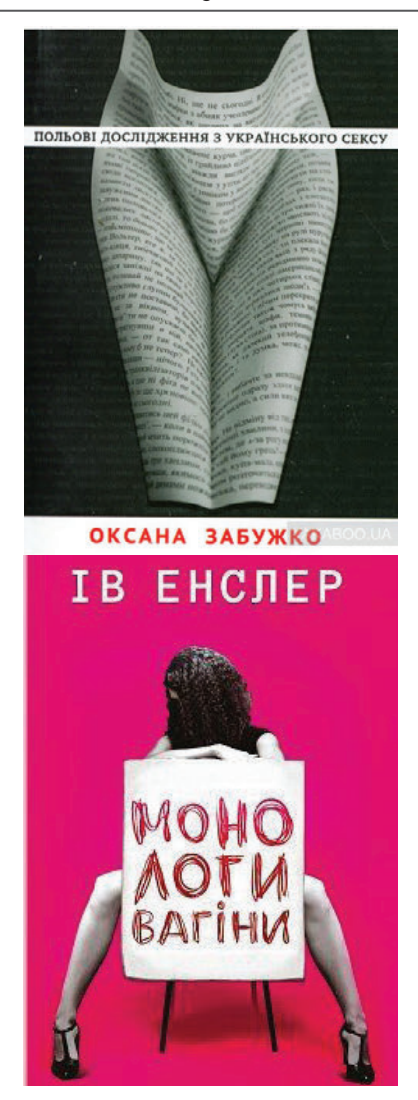
Fig. 4. 1. Oksana Zabuzhko's. «Field Studies on Ukrainian Sex».

Рис. 4. 1. Оксана Забужко. «Польові дослідження українського сексу».