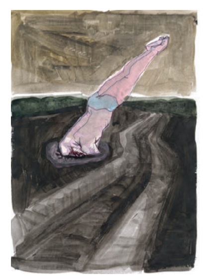
Fig. 4. 5. Vlada Ralko. Kiev Diary. 2013. Рис. 4. 5. Влада Ралко. Київський щоденник. 2013.

Ralko's figures are diagrams not personalities, so they stand in for the viewer. It is not the figure that is cut, but the viewer themselves. It is by taking on the painter's point of view that Ralko's paintings open up to the viewer (Brown, 2010) (fig. 4. 5.).