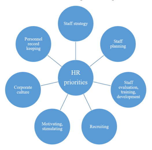
Fig. 1. The main trends of HR operation (author's development based on) [2]

HR is a structural subdivision of an enterprise business line which systematically executes the function of personnel management of the enterprise. HR activities are diverse and multifunctional and are involved in all areas of the activities of the enterprise. Constant exaggerated development of the high technology field specifies the permanent adaptation of HR service. The main trends of HR operation at a high-tech enterprise are given in fig. 1: